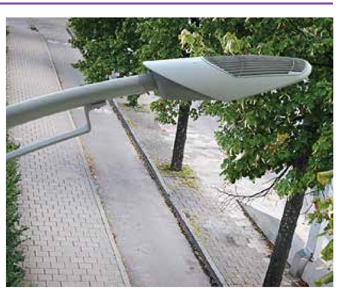
Roadway and Pedestrian Lighting Streetlight fixtures will be the same as those used on Jasper Avenue New Vision. Simpler poles will be used for both roadway and sidewalk lighting.

Comfortable wood seating with back and arm rests will be provided along Jasper Avenue. The adaptable design allows for the creation of a variety of seating types that are visually consistent.