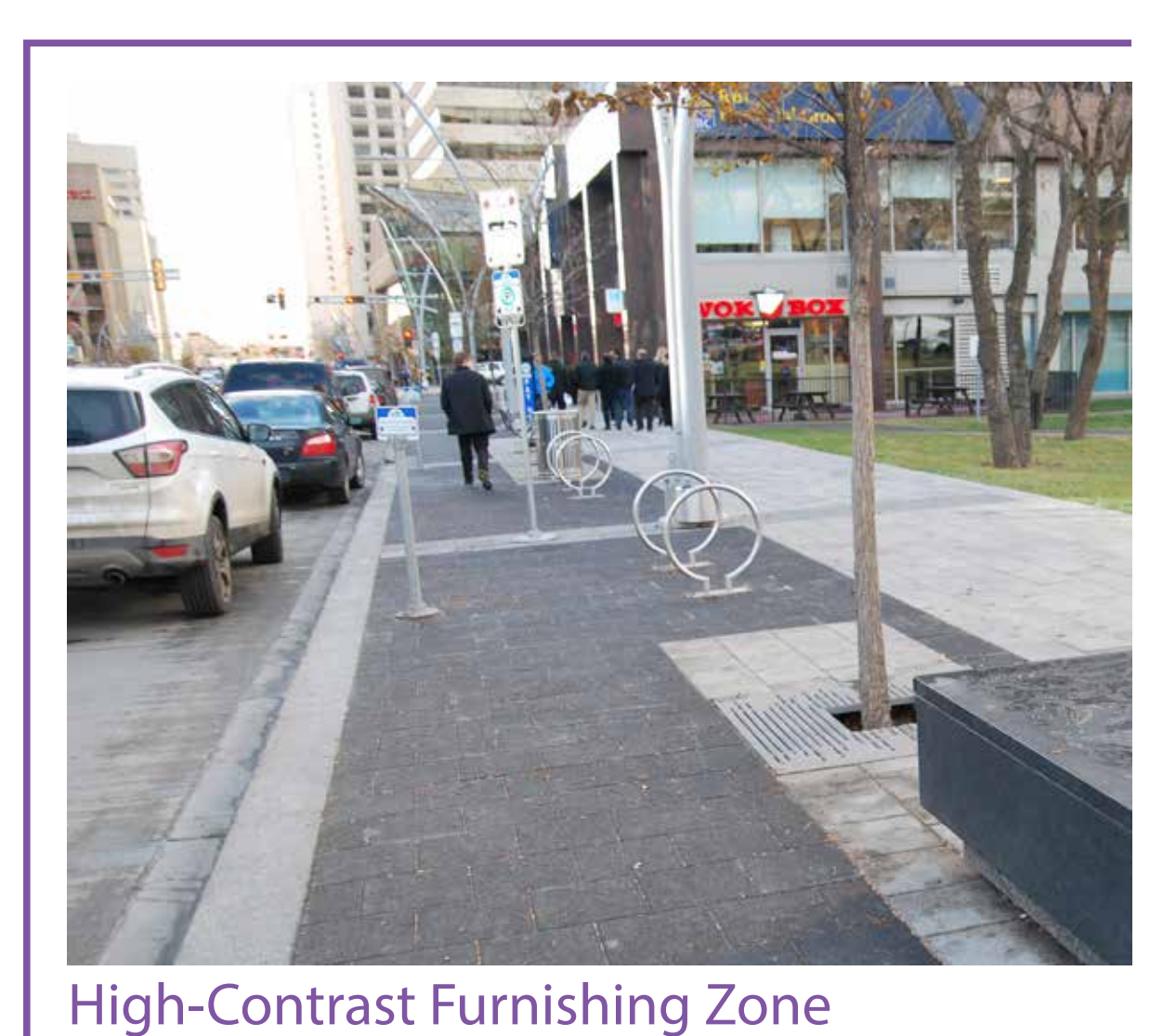
Contrasting colour of paving in the furnishing zone improves wayfinding clarity for the visually impaired. Dark colour concrete paving stones, similar to Jasper Avenue New Vision are proposed.