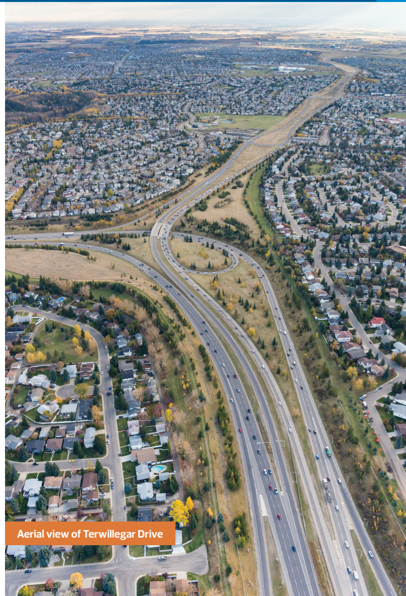
Aerial view of Terwillegar Drive

The preferred option will be recommended to Council in mid 2018.