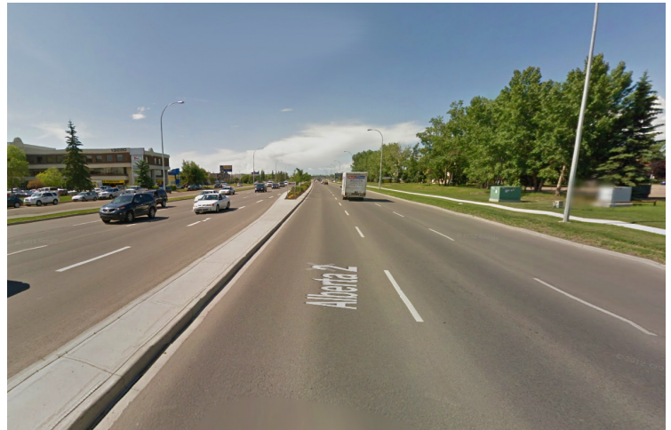
St. Albert Trail - 6 lane urban road