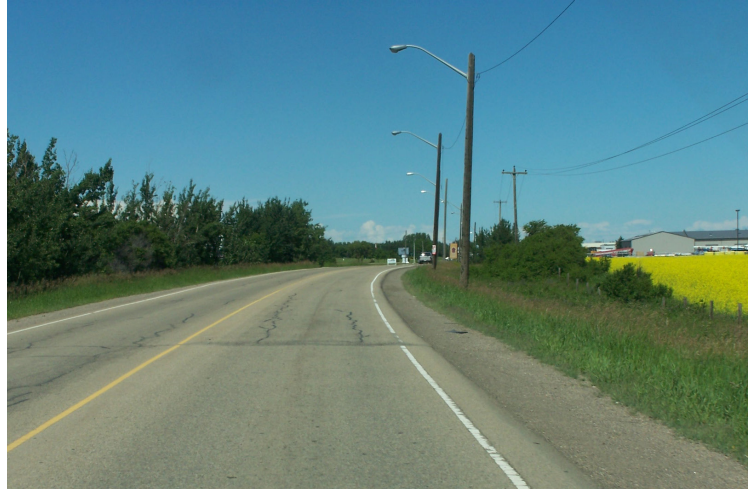
215 Street - 2 lane rural road

There is currently no budget allocated to this project and therefore no timeline for construction.