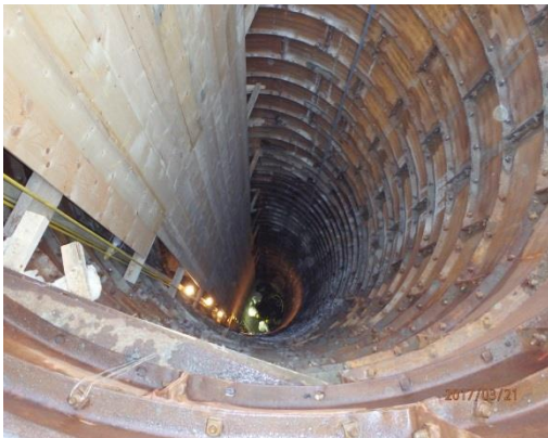
Vertical Access Shaft on 151 Street Shaft is under construction and crews have completed 98% shaft excavation.

As part of the new bypass tunnel construction on 151 Street, between 100 Avenue and 99 Avenue, the City is constructing a 3 m diameter, 26.1 m deep shaft to help with excavating the tunnel and installing the 1200 mm sewer pipe. (See attached image for details on the reverse side of this Notice.) The bypass tunnel allows the existing tunnels on 99 Avenue, 151 Street and 100 Avenue to be renewed in dry conditions, reducing the project timeline and construction risks.