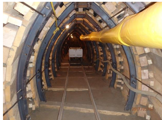
Hand Tunnel on 151 Street Crews have completed 31% of the new bypass tunnel along 151 Street.

Work is scheduled up to 12 hours per day (7:00 a.m. – 7:00 p.m.) six days per week (Monday through Saturday). Construction commenced on Tuesday, February 21 and is ongoing. Depending on ground conditions and weather, the tunnel should be in service by the end of June and surface restoration of the shaft area sometime in August 2017.