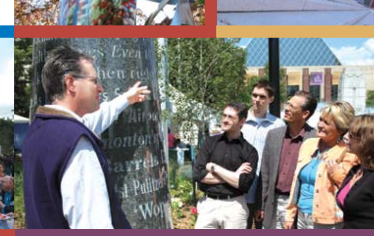
Sir Winston Churchill Square