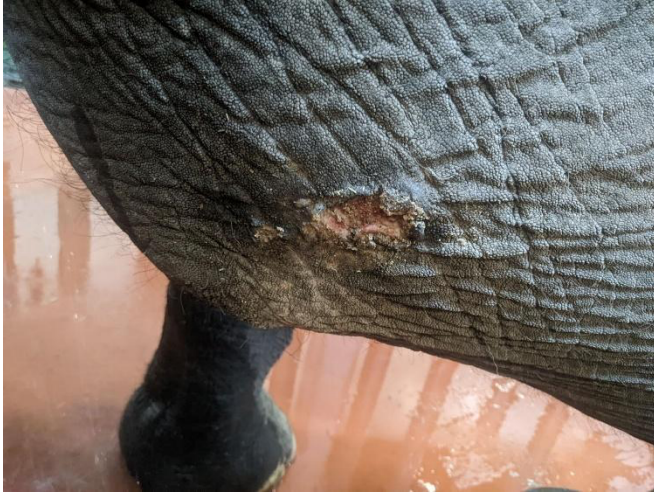
Close up of right elbow