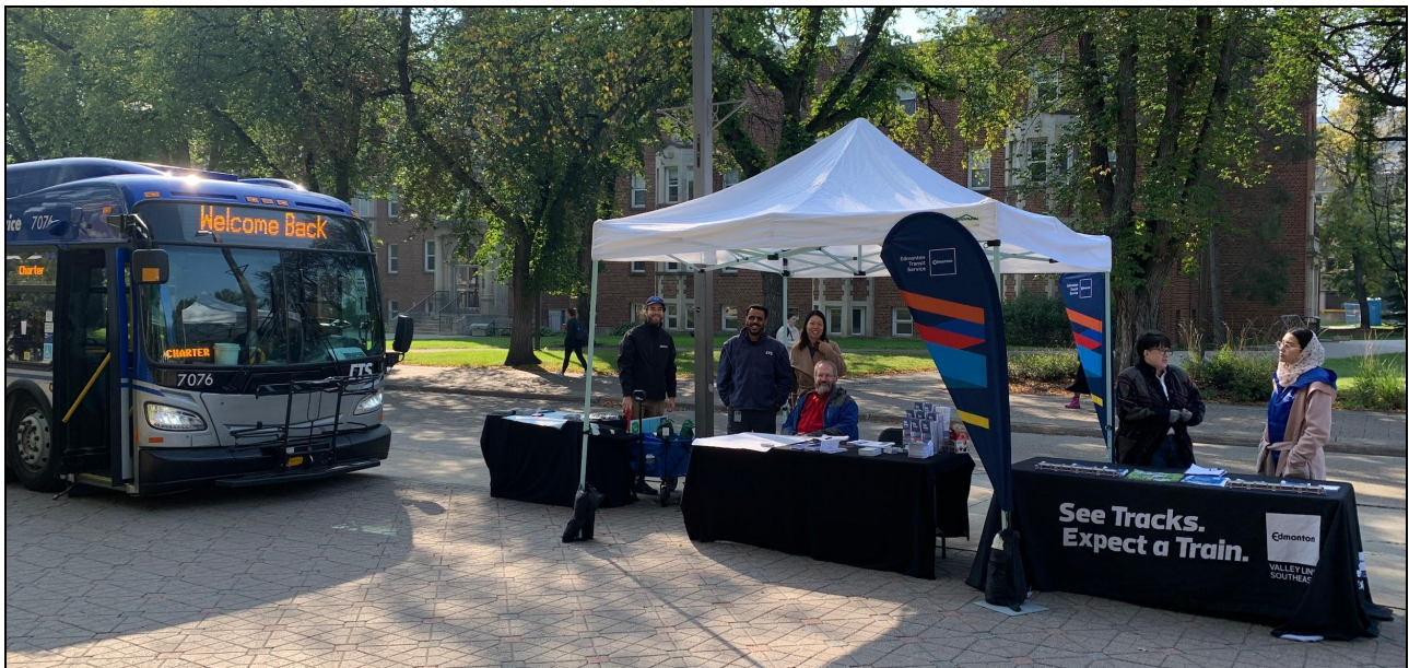
Outreach at University of Alberta