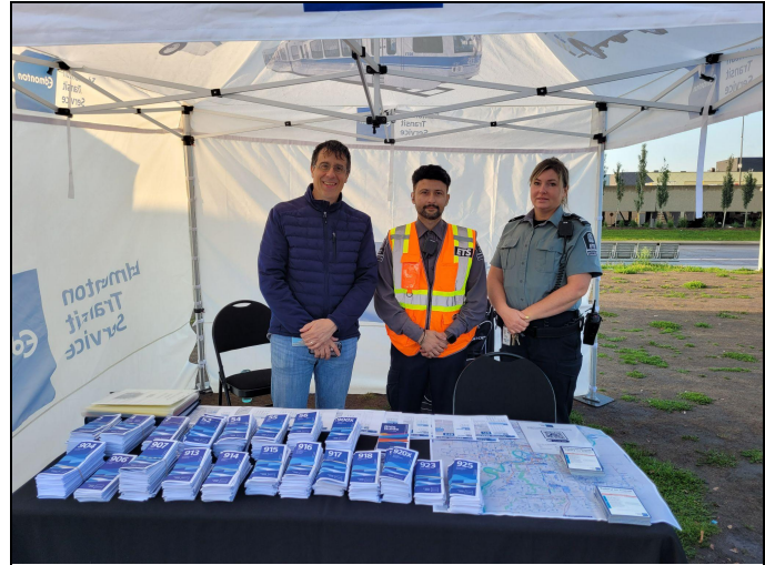
Outreach at West Edmonton Mall Transit Centre

This year's outreach activity included staging a bus on the University of Alberta campus during the university's first week of welcome events. The City of Edmonton's bike street team joined ETS to promote the city's bike network and multi-modal transportation, and demonstrate how to use the bike rack on buses. The Valley Line street team also joined ETS to educate students about the new LRT line.