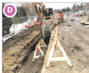
Area 4 - Drainage work along Stony Plain Road