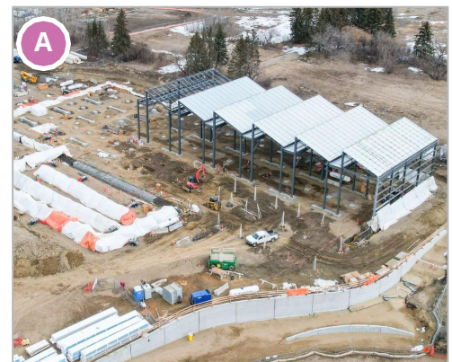
Area 8 - Structural steel construction for the storage facility at Lewis Farms

During Q1, reviews for the preliminary light-rail vehicle (LRV) design submittals were ongoing. In March, a major milestone occurred when a full-scale model of a portion of the future LRV arrived in Edmonton. This model will be used by the City to evaluate and improve various technical, driver-facing and user-facing elements of the train.