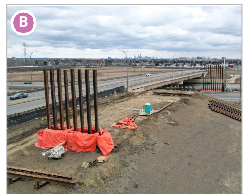
Area 7 - Steel piles for the Anthony Henday Drive LRT bridge