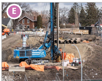
Area 3 - Piling work for Stony Plain Road Bridge