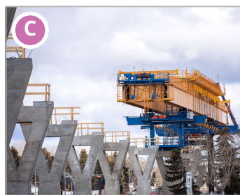
Area 6 - Piers and gantry crane for the elevated guideway along 87 Ave