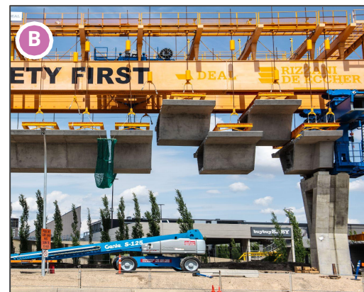
Area 6 - WEM Elevated Guideway Segment Installation.