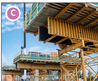
Area 6 - Misericordia Station Elevated Guideway Construction