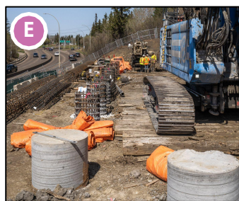
Area 3 - Piling work on east side of Stony Plain Road