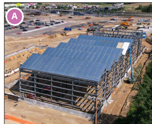
Area 8 - Lewis Farms Storage Facility Construction.

During the second quarter of 2023, construction activities were underway in several locations along the Valley Line West LRT corridor. MIP continued with construction of the Lewis Farms Storage Facility, which included the installation roofing for the building and additional grade foundation beams and structural steel (Photo A). Further east, in Area 6, MIP continued to install Y-piers and concrete segments at the elevated guideway next to West Edmonton Mall (Photo B). In Q2, 93 segments were cast at the precasting facility (with 173 segments cast to date). Construction also continued at Misericordia Station (Photo C). Drainage and temporary roadworks have been underway throughout Areas 3, 4, 5 and 6 in preparation for upcoming construction (Photo D). Construction also continued on the new Stony Plain Road Bridge, where piling is now complete and bridge supports have progressed (Photo E). Work at Gerry Wright OMF-B continued, with foundation supports for the building underway (Photo F).