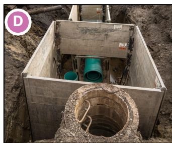
Area 4 - Drainage work on Stony Plain Road/144 Street