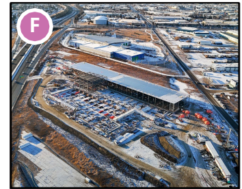
Area 9 - Gerry Wright OMF Construction