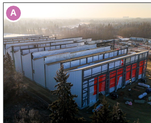
Area 8 - Lewis Farms Storage Facility

Final design review for the Stage 2 light-rail vehicle (LRV) continued throughout Q4. Review will continue into 2024.