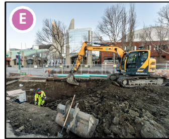
Area 2 - 104 Avenue Civil Drainage Installation and Abandonments