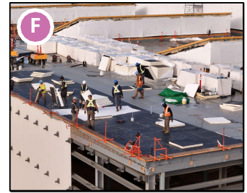
Area 9 - Gerry Wright OMF-B Roof & Wall Insulation