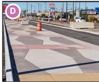
Area 4 - West Jasper Place Sidewalk Construction