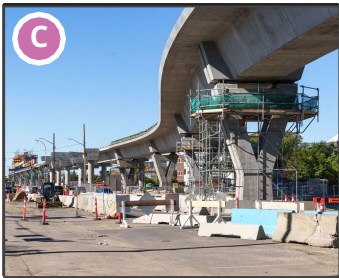
Area 6 - Elevated Guideway Progress