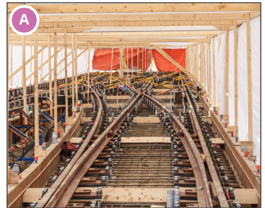
Area 8 - Lewis Farms Storage Facility Trackwork

Final Design Review (FDR) for the light rail vehicle (LRV) continued throughout Q3. First Article Inspections continued on several components in Q3 and manufacturing continued.