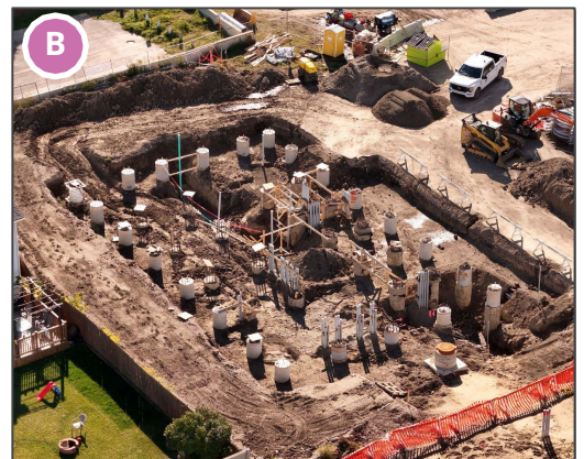
Area 6 - 87 Ave/189 St Utility Complex Piling