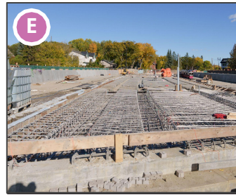
Area 3 - Stony Plain Road Bridge Rebar & Formwork