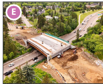
Area 3 - Stony Plain Road Bridge