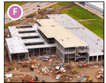
Area 9 - Gerry Wright OMF-B