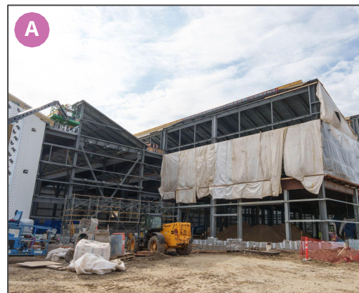
Area 8 - Lewis Farms Storage Facility

Final Design Review (FDR) for the Stage 2 light rail vehicle (LRV) continued throughout Q2. FDR #1 Milestones were complete in Q2. First Article Inspections started on several components in Q2 and manufacturing continued.