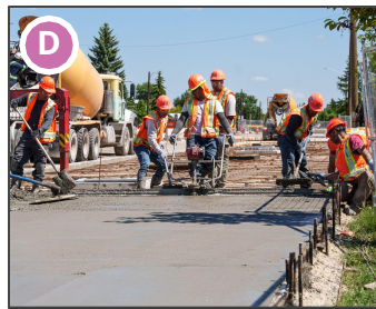
Area 5 - 156 Street Roadworks