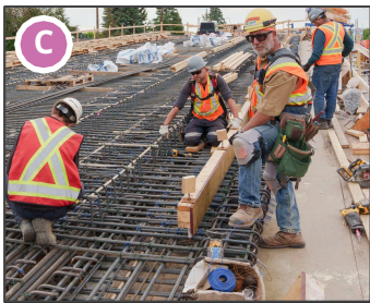
Area 6 - Elevated Guideway Ramps