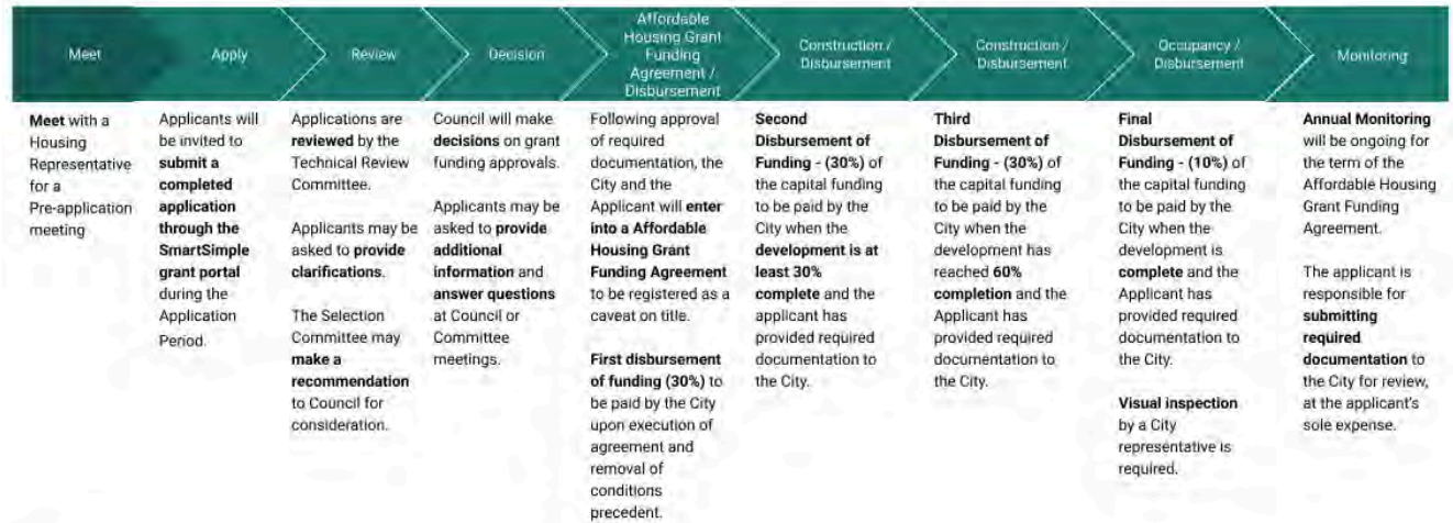
Process Chart Indigenous Housing (Rehabilitation - Planned Development) Version: January 2025