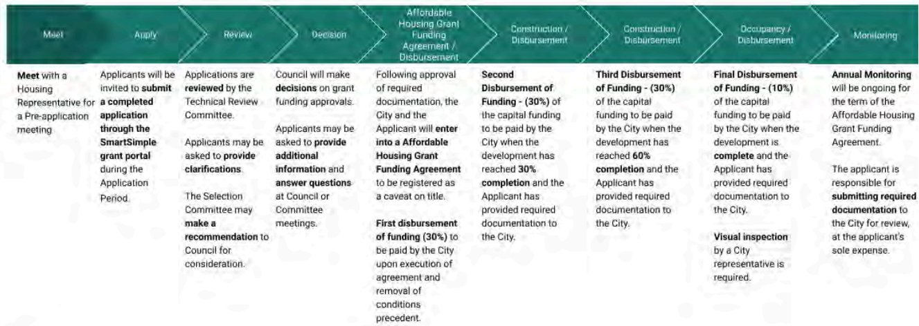
Process Chart Indigenous Housing (New Construction - Planned Development) Version: January 2025