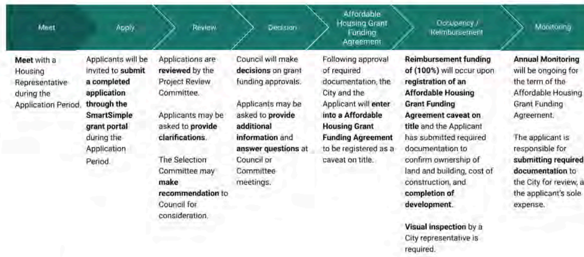
Process Chart Indigenous Housing (New Construction - Reimbursement) Version: January 2025