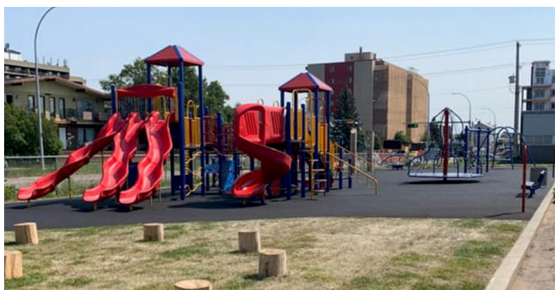
St Francis of Assisi School playground reopening, July

As in years past, the Fort Road Business Association (Business Improvement Area) worked alongside the many diverse businesses and land-owners that are located in and around the Fort Road and Belvedere areas.