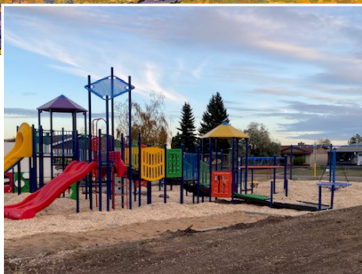
Princeton School playground redevelopment, October

“ If we missed you in our Smudging and Interdenominational Blessing, know that our thoughts, healing and prayers were with you. It was an amazing uplifting inspiring morning. People waving, watching for us through their windows, walking over to see us, people coming out of their homes to be with us and receive. May we be at peace as one and this is the start of a new day! ”