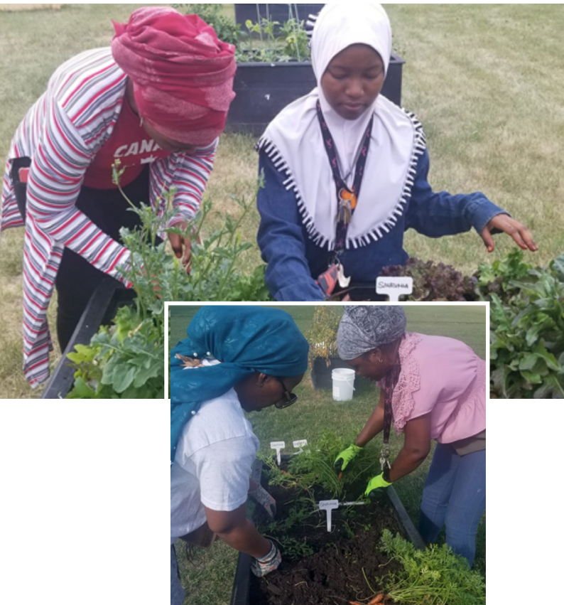
Sinkunia members at Packingtown Growers pop-up community garden, May-October

Throughout 2021, neighbourhood-based agencies and organizations offered community-focused activities, events and programs both in-person and virtually. These initiatives support area residents and also spread awareness of and engage with Edmontonians from the surrounding neighborhoods.