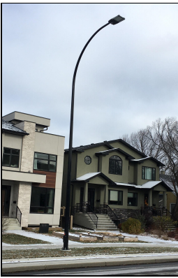
Powder coated galvanized