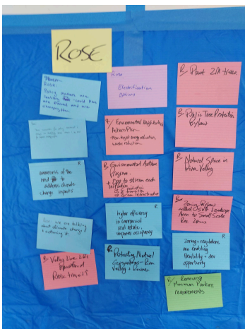
The text on this image is not intended to be legible. This image shows the “Roses” that were shared during the in-person session.