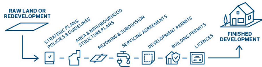
Figure 1. The City of Edmonton's planning and development continuum - the context for the Climate Resilience Planning and Development Action Plan.

Edmonton's planning and development continuum includes residential and non-residential development and the supporting infrastructure. Across the continuum, development decisions are supported by guiding plans, policies, guidelines, and internal processes (e.g., area structure plans, design and construction standards, zoning bylaws). To comprehensively integrate climate action across the continuum, the CRPD Action Plan will holistically consider each step in the planning and development process (Figure 1). An example of how the CRPD Action Plan may influence the planning and development continuum is by updating the Terms of Reference for Area and Neighbourhood Structure plans to enable climate resilient development.