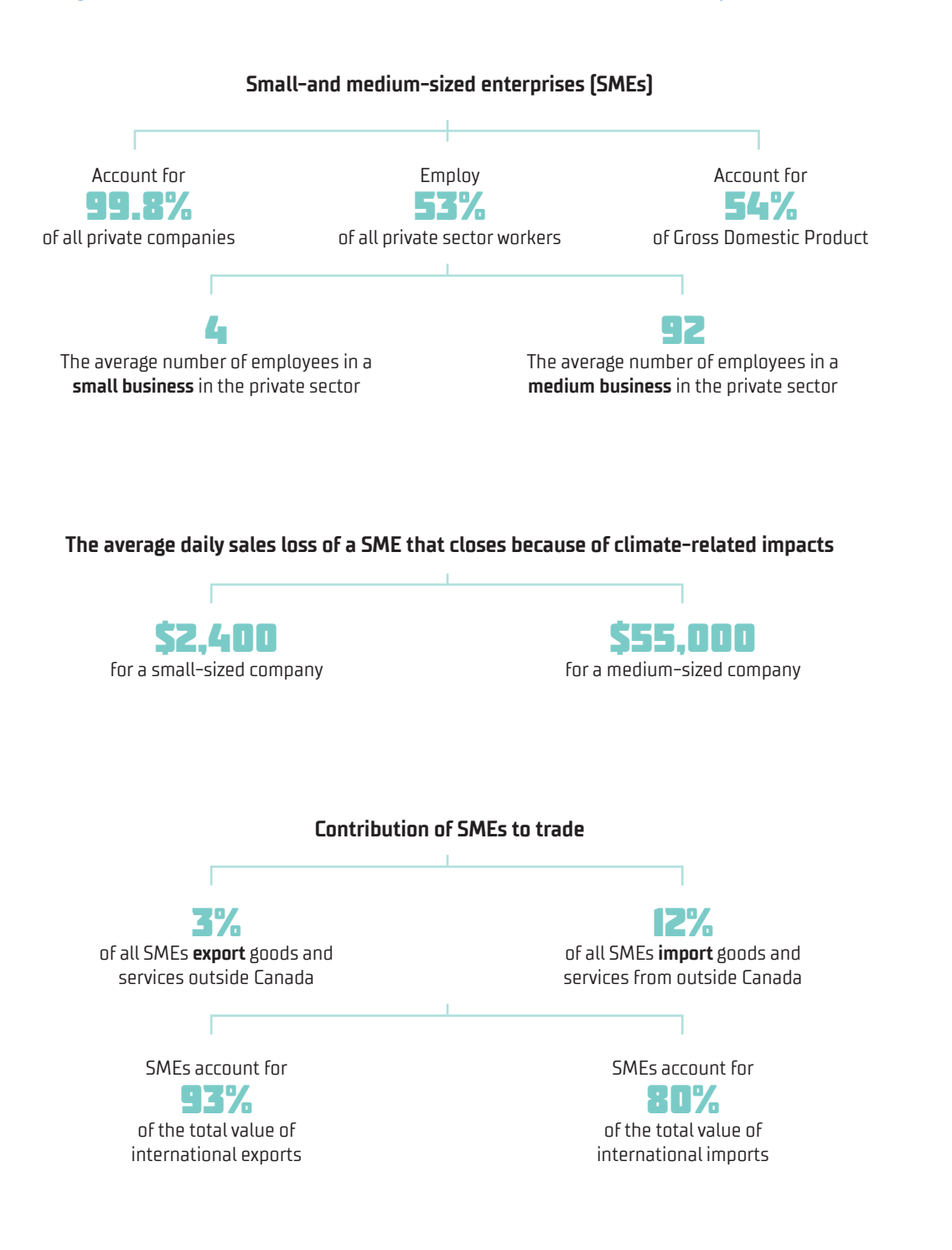
Figure 1: Small- and medium-sized businesses are the backbone of the local economy in Edmonton