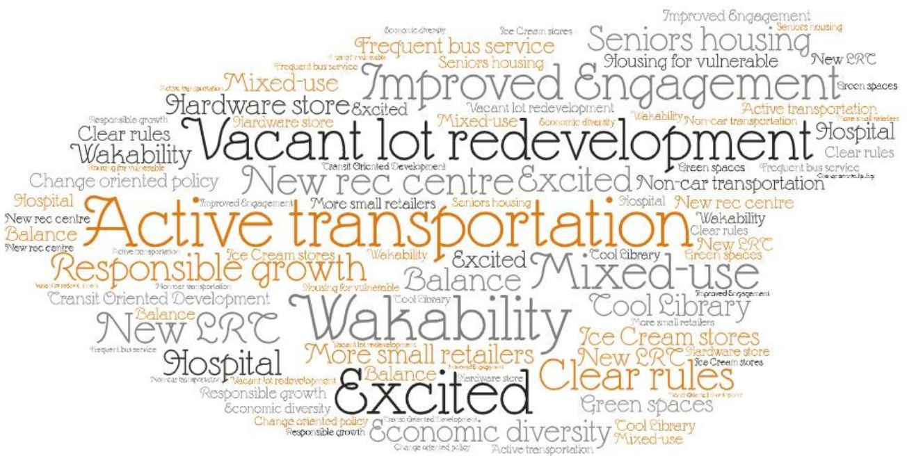
Figure 4: “What are you excited to see happen in your district as Edmonton grows to 1.25 Million people? ”