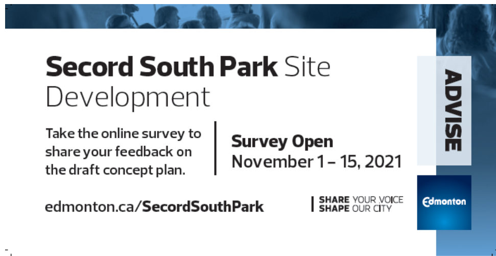
Figure Four: Roadside sign advertising the online survey