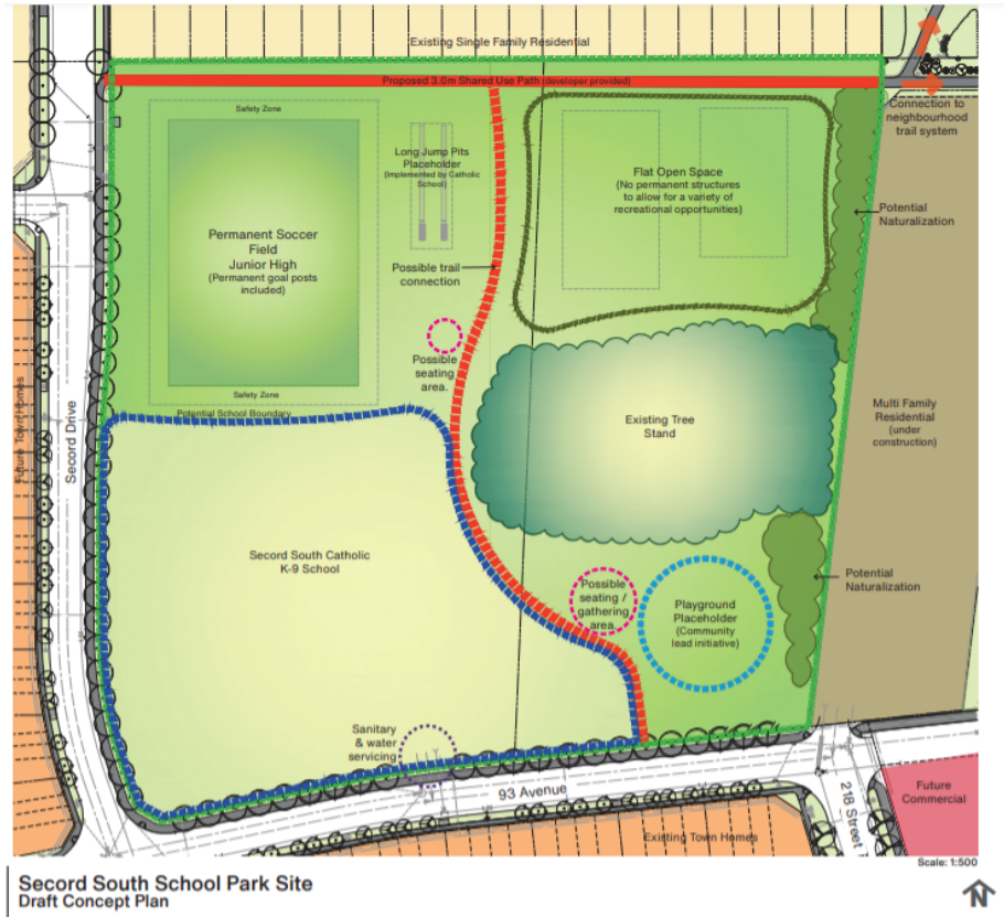
Figure Two: Draft concept plan presented through engagement