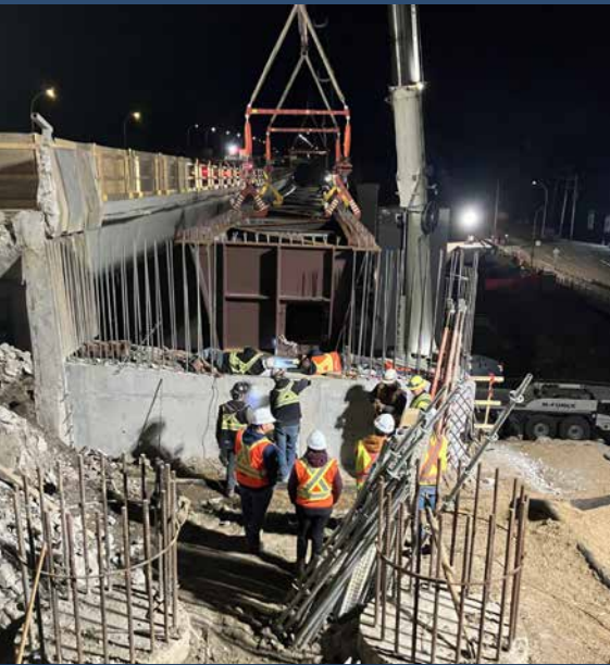
Stage Two Rainbow Valley Bridge construction