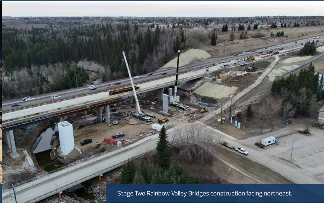
Stage Two Rainbow Valley Bridges construction facing northeast.