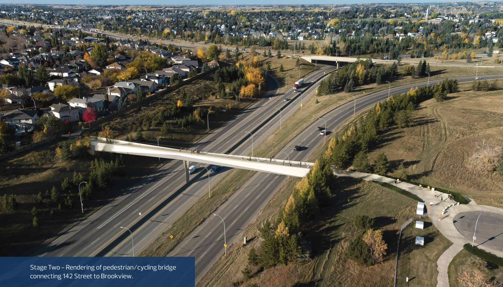
Stage Two – Rendering of pedestrian/cycling bridge connecting 142 Street to Brookview.