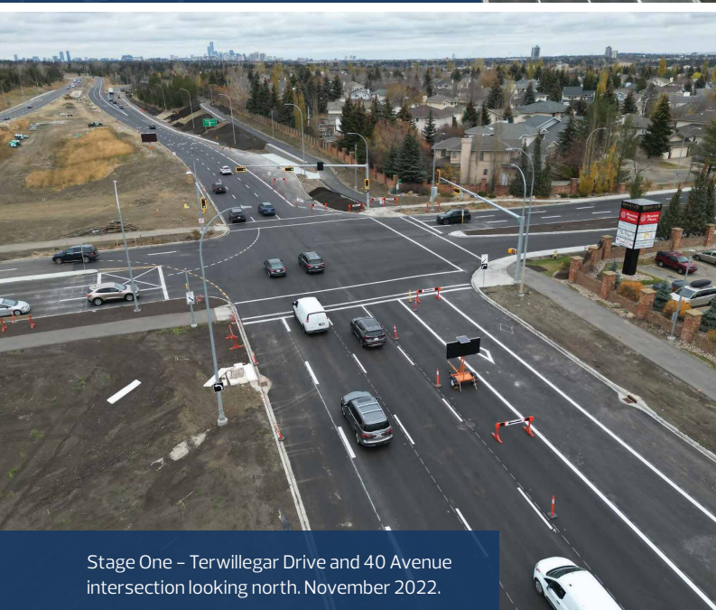
Stage One – Terwillegar Drive and 40 Avenue intersection looking north. November 2022.