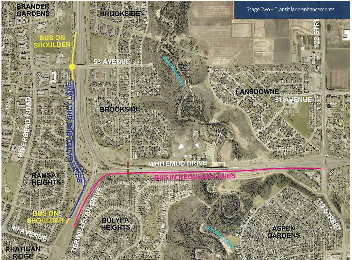
Stage Two – Transit lane enhancements