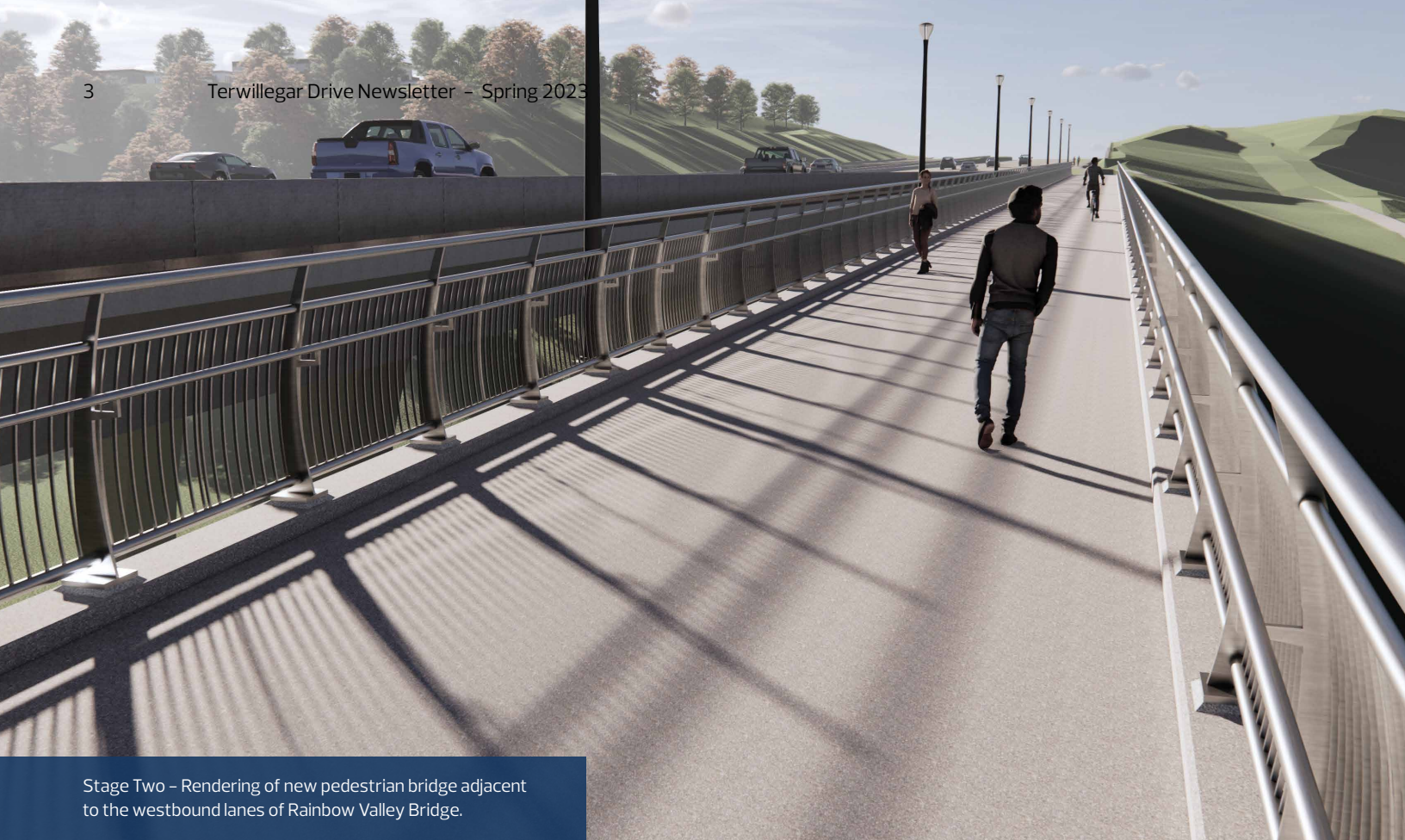
Stage Two – Rendering of new pedestrian bridge adjacent to the westbound lanes of Rainbow Valley Bridge.