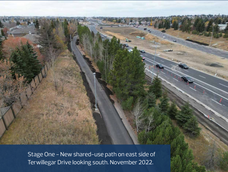
Stage One – New shared-use path on east side of Terwillegar Drive looking south. November 2022.