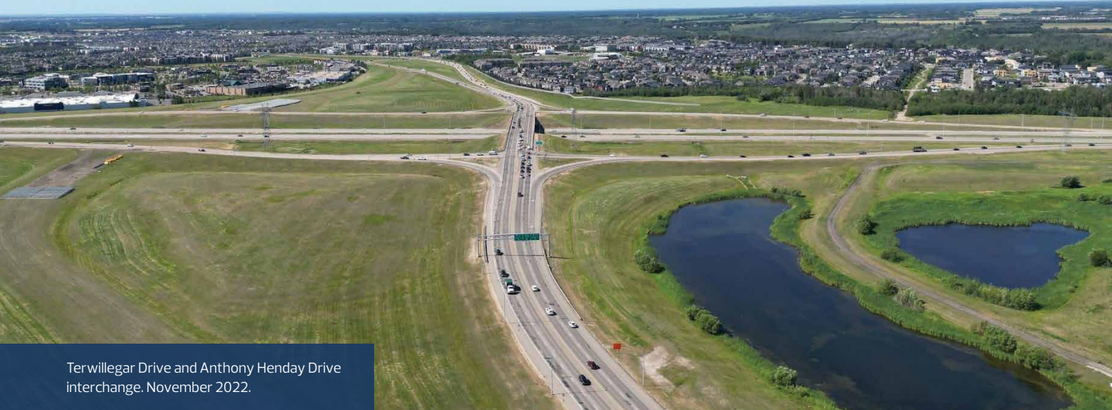
Terwillegar Drive and Anthony Henday Drive interchange. November 2022.