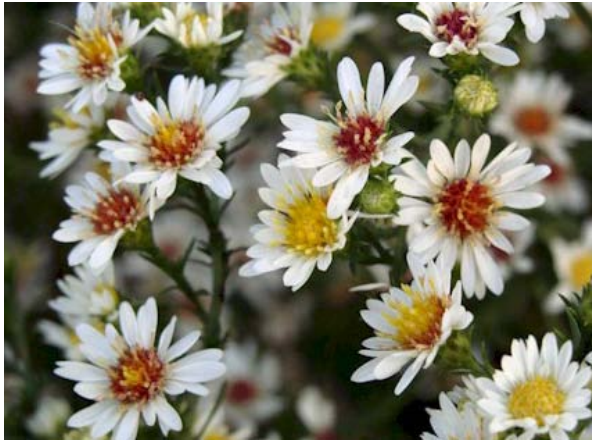
Above image: Heath aster.

Aster flowers grace most regions and habitats across Canada, thriving in areas with cool and moist summers. They are commonly seen in fields and on roadsides, and they brighten fall gardens while little else is blooming.