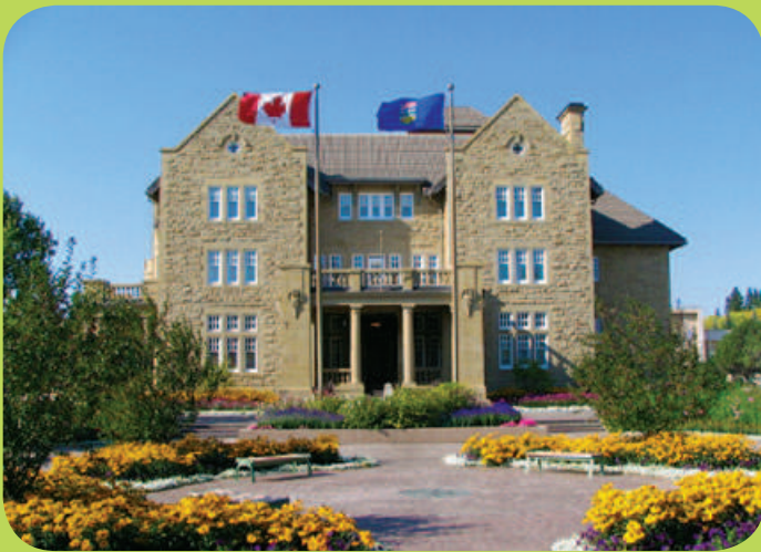
Historic Government House