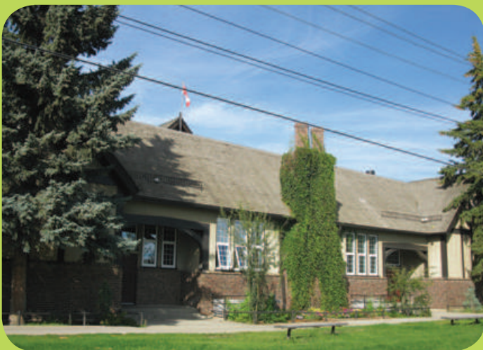
Historic Glenora Elementary School