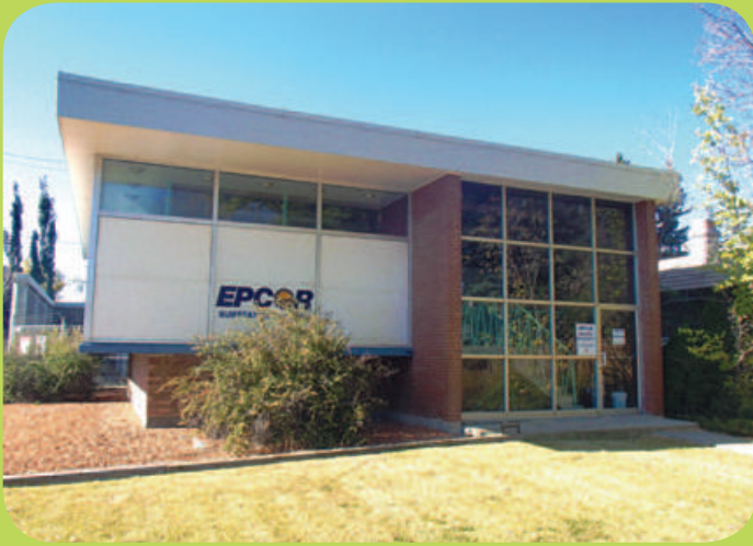
Historic Glenora Substation