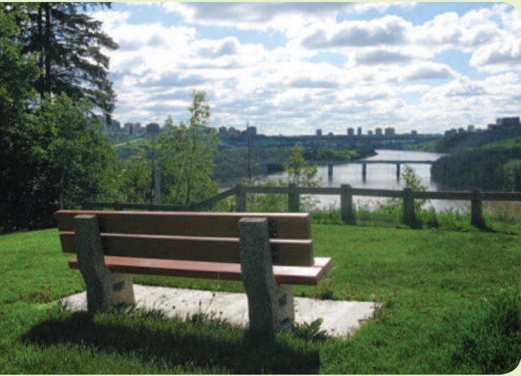
St. Georges Crescent Viewpoint