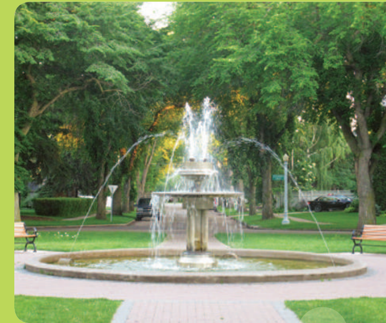
Alexander Circle Fountain