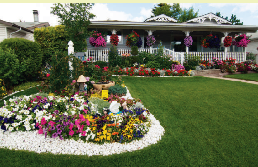
Front Yards in Bloom, 2013 Award of Merit Winner