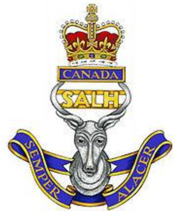
South Alberta Light Horse cap badge.