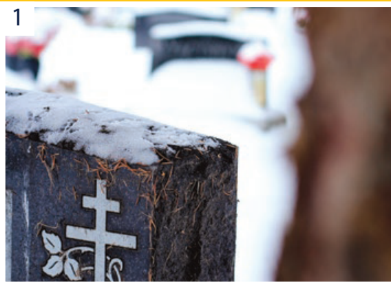
1 St. Michael's Cemetery