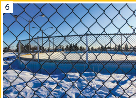
6 Steele Heights Community League Rink