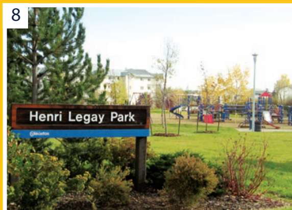
8 Henri Legay Park