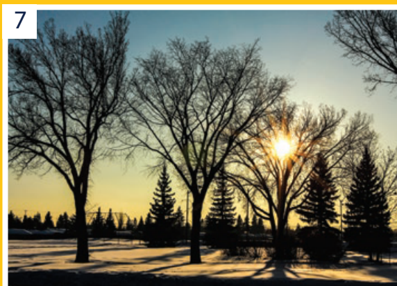
7 York Park