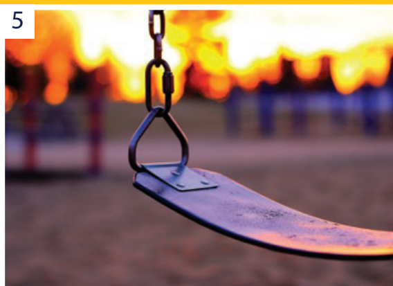
5 York Playground