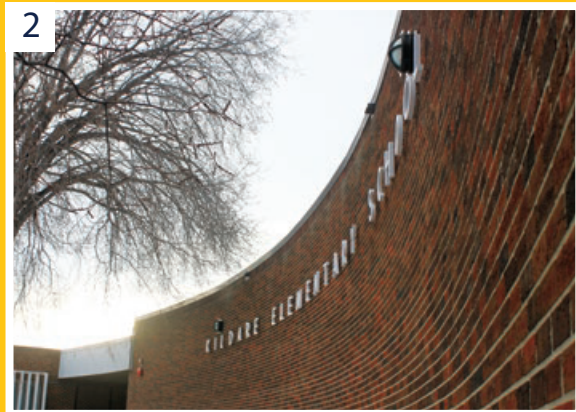
2 Kildare Elementary School