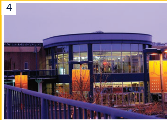
4 Londonderry Mall