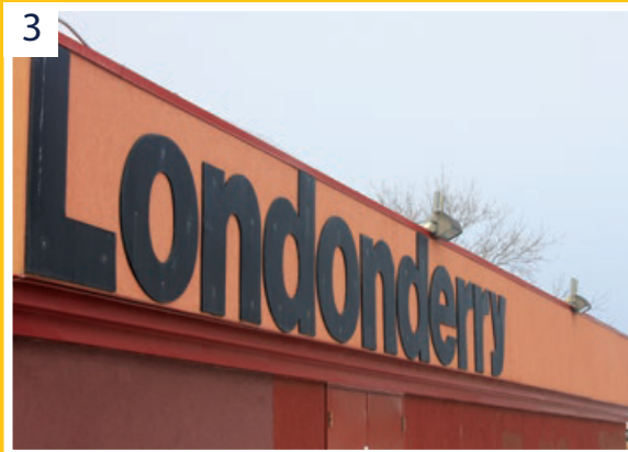
3 Londonderry Community Hall