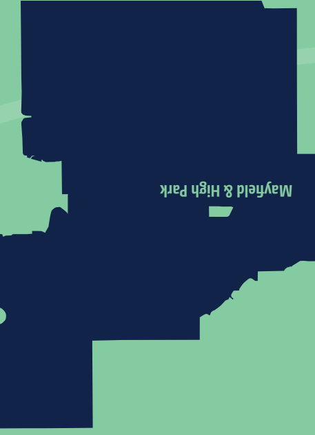
Mayfield & High Park

The High Park neighbourhood was formerly part of the Town of Jasper Place, which was annexed to the City of Edmonton in 1964. While High Park has been in existence since 1912, development in the area did not get under way until the 1950s and 1960s. The neighbourhood is smaller than most and is dominated by smaller single-family bungalows and generously sized lots. The streets are laid out in a grid pattern. High Park has an elementary school and two parks (High Park and Ken Newman Park). The neighbourhood may have been named after one of two High Parks located in northeast England. The Community League was founded in 1959 and continues to be a hub of sport and recreation for the community.