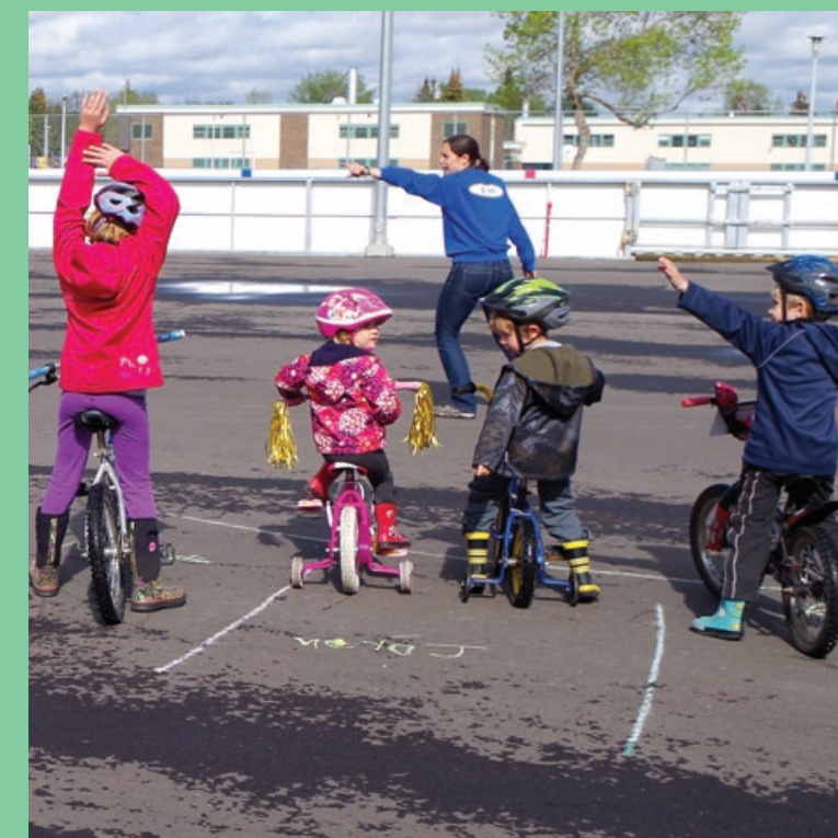
Bike Safety – Turn left!