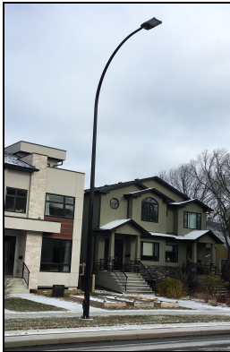
Powder coated galvanized