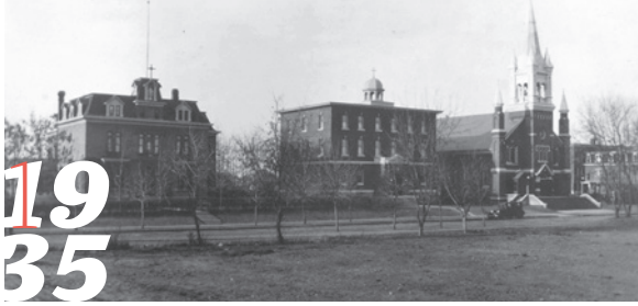
The Oblate Provincial House, flanked by the Convent (left) and St. Joachim (right) c. 1937.