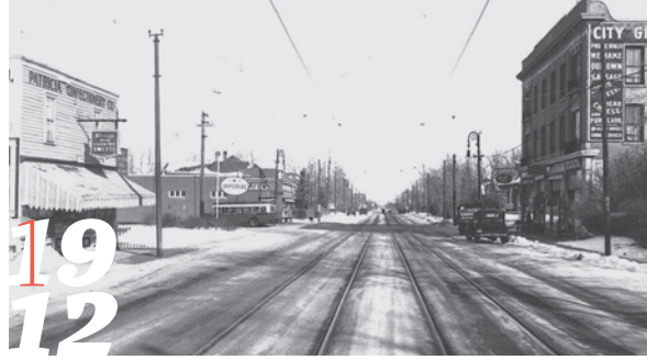
The Buena Vista at right, 1939.

In large part, the Buena Vista was successful. It enjoyed almost continuous occupancy: the apartments were popular with the clergy from nearby churches, and the main floor was almost continuously occupied as well. The three storefronts usually included a pharmacy, meat market, and grocery store. Perhaps one of the best-known enterprises was an early P. Burns and Company Meat Market, which was located here for a short time. Despite this measure of success, the Riverview Land Company never realized the profits they had sought. By 1930, the City sold the Buena Vista for nonpayment of taxes.