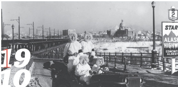
U.S. Military Police Alaska Highway patrol, 1943.

At 2,800 feet in length and 156 feet in height, the High Level Bridge is second in size in Alberta only to the Lethbridge High Level Bridge. Men worked on it, day and night, from August 1910 until September 1913. The final cost was approximately $2,000,000 and three workmen's lives. On the third of October, 1912, fifty steelworkers walked off the job. Their demands included a 9- as opposed to 10-hour working day at 50 cents per hour, a raise of a nickel. The strike was brief, and no records could be found as to whether or not their demands were met.