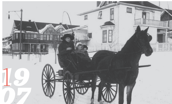
Horse-drawn buggy in front of the Kirkhaven c. 1914 (GA NC-6-1286)

The Kirkhaven (1907) and its neighbour to the east, the Findlay Residence (1910), are two of the earliest residential structures in the district.