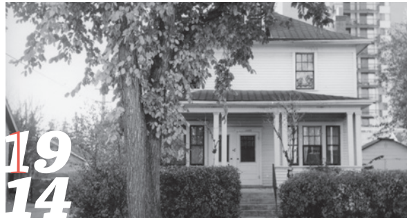
John Wood Residence, c. 1975