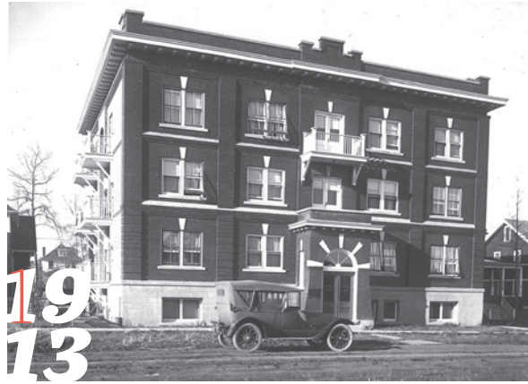
The Derwas Apartments c. 1917. (GA NC-6-2908)

ON EACH OF THE THREE STOREYS ARE FOUR SUITES, EACH WITH A FIREPLACE IN THE LIVING ROOM, A FORMAL DINING ROOM, A BALCONY, AND A SINGLE BEDROOM.