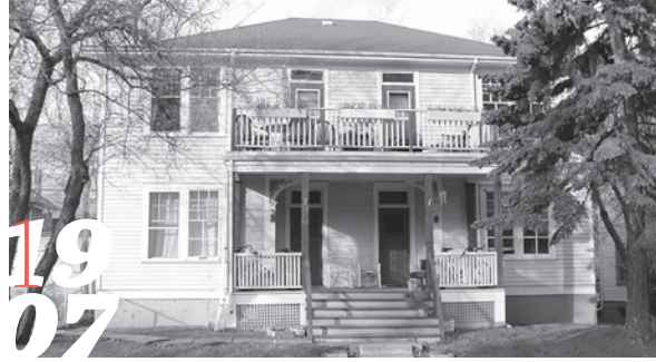
John L. Lang Apartments, 2003

The Edwardian-influenced building was constructed during the housing boom that