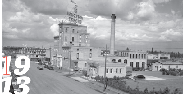
Edmonton Brewing and Malting Company Ltd. Building and the Administration Office Building, 1949

The Edmonton Brewing and Malting Company Ltd. Building was constructed as a replacement of their smaller brewery, originally located in the neighbourhood of Rossdale. The Oliver brewery has had numerous owners over the years, and spent its last years in the hands of Molson Canada. Evidence of the evolution of Alberta's brewing industry can