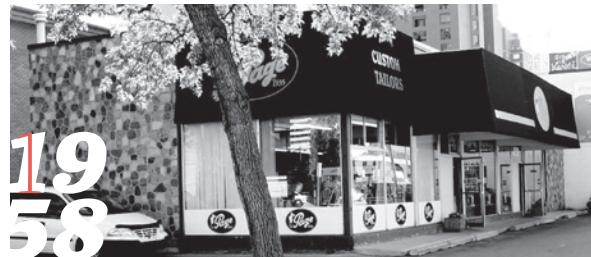
Page the Cleaners, 2008 (COE)

Page the Cleaners is historically significant for its association with the development of the Oliver neighbourhood after World War II. The plant has capitalized on its prominent Jasper Avenue location, and has remained a citywide, long term business. Its high style expresses the company’s forward marketing and new advances in dry cleaning. The building was constructed in the age of the drive-in and the drive-through, a time when most Edmontonians were doing business by cars. As a result, the spacious parking and drop off space was a prized design component.