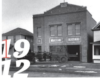
Fire Hall No. 4, n.d. (CEA EA-10-1002)

Streamline Moderne Style is represented in the rounded front parapets, streamlined banding, curved entry elements, and horizontal speed lines on the front façade. The interior of the building features original hardwood floors, fireplaces, kitchenettes, bathroom fixtures, stairs and balustrades.