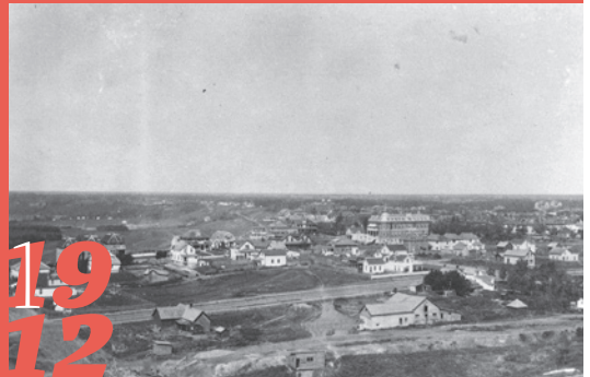
The Oliver District c. 1912 (EA-246-61)