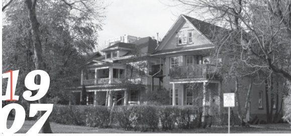
Dame Eliza Chenier Residences (left) and Lester N. Allyn House (right), 2003