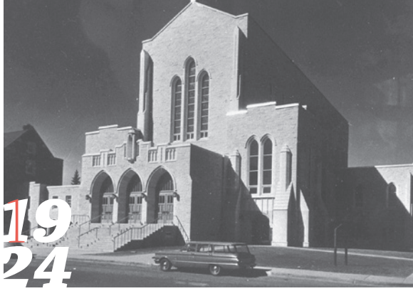
St. Joseph's Cathedral c. 1965. (CEA EA-10-532)

St. Joseph's Basilica is the Cathedral church of the Catholic Archdiocese of Edmonton. The term cathedral refers more to a church's function than to its design. It is the home parish of the Archbishop.