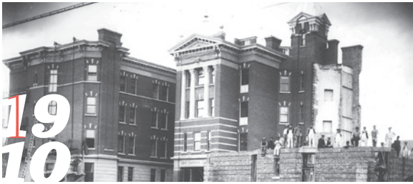
The LeMarchand Mansion c. 1914. (CEA EA-270-07)

See entry for the Oliver West Tour, Site 1.