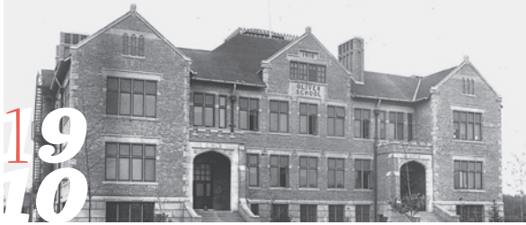
Oliver School c. 1912. (GAN C-6-103)

THEY ARE TYPICAL OF THE FRAME HOUSES BUILT IN THE WEST END, AND THROUGHOUT EDMONTON, DURING THE EDWARDIAN ERA, WHICH WERE LARGELY SWEEPED AWAY BY THE BUILDING BOOM IN THE 1970S.