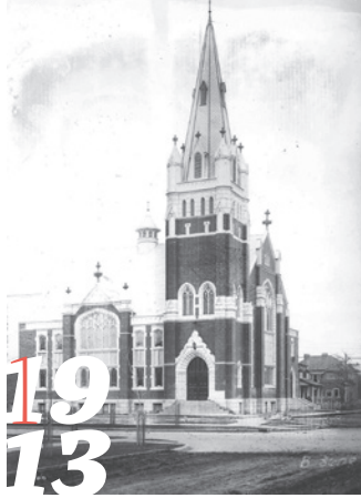
Robertson Wesley United Church, n.d.

All told, the cost of the land and building came to $110,386. Even this sum placed the parish under considerable financial strain for the next decade. Not until the 1950s could the parish gather funds for its proposed Sunday school.