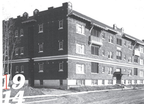
The Annamoe Mansion c. 1915. (GA NC-6-2919)

he Annamoe Mansion, unlike the grander LeMarchand Mansion, has a principal façade full of windows to take advantage of magnificent river valley views. Despite its more modest scale, the Annamoe has some interesting features. A variety of bricklaying patterns is used on the front of the three storey red brick building, creating a textured, two-dimensional effect. White accents the details in the design. Stone provides variety in the brick, and both the window frames and the balconies with their supporting brackets are painted white. The red tile-roofed canopies which span the façade lend a rather Spanish air to this building.