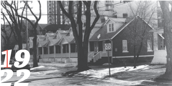
Row Houses on 102 Avenue at 118 Street, 1993. (ACD)

These homes have a decided charm. In size, scale and detailing they are cozy, and cottage-like. The red brick gable-roofed units are arranged in a continuous line, punctuated only by gabled dormers and porches with individual doors. The double-hung windows have multipaned upper sashes, and a railing runs the length of the row. The detailing is all in white, and the total effect is both modest and dignified.