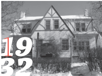
Yeates & Williams Residence, 2006

The Yeates and Williams Residence is on the City of Edmonton's Inventory of Historic Resources, meaning that it is eligible to be designated as a Municipal Historic Resource.