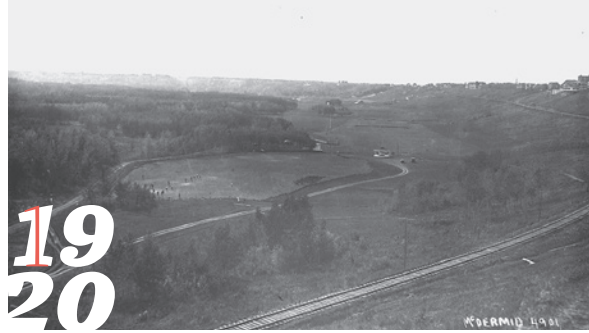
Birds-eye view of the Golf Links c. 1920. (GAN C-6-4901)

After Fort Edmonton was established in 1795, Indigenous peoples camped here while trading furs. In 1913, the City of Edmonton paid the Hudson's Bay Company $310,000 for 155 acres in the river valley, including this area. Both a 1907 report by Frederick N. Todd, the landscape architect responsible for the National Capital