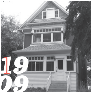
Murdoch McLeod Residence (10147 – 115 Street), 2016.

The Murdoch McLeod Residence, located at 10147 – 115 Street NW, is on the City of Edmonton's Inventory of Historic Resources, meaning that it is eligible to be designated as a Municipal Historic Resource.