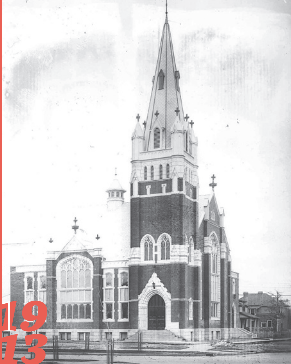
Robertson Wesley United Church, n.d.

erected by the French Catholic Church and community, lent a distinct flavour to the district. In 1886, the church of St. Joachim was built on 110 Street north of 99 Avenue. A larger brick church replaced this in 1899. In 1895, the Edmonton General Hospital was built a few blocks away. Next, a convent was erected just south of St. Joachim. A rectory for the church at the north end of the block soon followed. In 1935, the Oblats Maison Provinciale was constructed to the south of St. Joachim Church. In 1905, the Misericordia Hospital was built on 111 Street between 98 and 99 Avenues. The 1914 Grandin Catholic School District completed the projects of the Catholic Community.