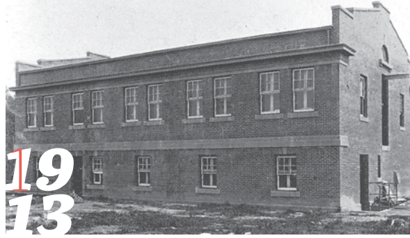
The West Side Exchange c. 1914. (ACD)

In 1949, an extension was built onto what was by then known as the Oliver Wire Exchange to meet the ever-expanding need for telephone service. In 1982, the Oliver Exchange equipment was upgraded to digital switching from the old dial equipment. This is particularly remarkable because it signifies that the Oliver Exchange