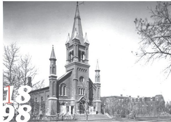
St. Joachim Church (right) with Rectory c. 1927. (GAND-3-3507a)

The current Church of St. Joachim is the fourth Edmonton building to bear that name. The first was a house chapel built in Fort Edmonton in 1859. The second was a frame church that stood from 1876 to 1886, and was located at 105 Avenue and 118 Street, the site of St. Joachim cemetery today. A historical plaque was installed at this site by the Alberta Historical Resources Foundation. The third church building was a wooden church erected at 111 Street, just south of 100 Avenue.