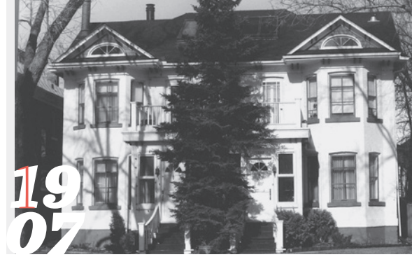
The Rankine Hume Residence (11204/11202 – 99 Avenue NW), 1993 (ACD)

Although the residences on the north side of 99 Avenue between 112 and 113 Streets have been altered over the years, they retain much of their original similarity. All are brick, two storeys, and have a two-storey bow window topped by an off-centre gable with an inset fanlight, and a second storey balcony above a first floor porch. Detailing is restrained, largely limited to the stone window sills and brackets under the eaves and verges.