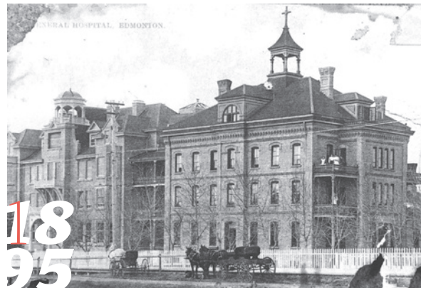
The Edmonton General Hospital c. 1910 (CEA EA-1-46)

The first Edmonton General Hospital, which faced south on Victoria Avenue, had 36 beds and was described as the largest, most substantial and costly building in Edmonton. It was a handsome three storey brick structure with sun porches in each corner, a hip roof capped by a belfry, and hip dormers on each of the four sides. Decorative detailing included corbelling, string courses, and voussoirs over the windows. The total cost, in 1895, was a staggering $30,000.