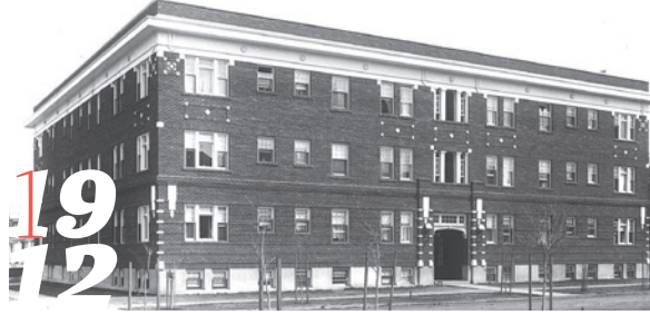
The Westminster Apartments c. 1914

Before World War I, Edmonton was the land of opportunity, attracting many new citizens. Housing was in great demand. Western Canada Properties Ltd., a development company from the East, seized the opportunity, and had the Westminster built in 1912.