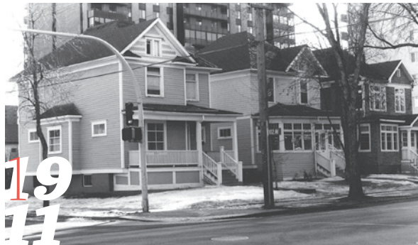
The 116 Street Residences, 1993. (ACD)

RETURN TO 102 AVENUE AND GO EAST FOR TWO BLOCKS. GO SOUTH ON 116 STREET.