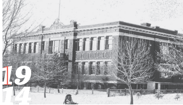
Grandin School n.d. (PAA OB575)

The two storey brick building is sober and symmetrical in its styling. The front is faced with pressed red brick, and is remarkable for the almost continuous row of windows on each storey. Contrasting stone is used for lintels and sills, as well as for belt courses. Raised brick provides textural and decorative detailing, being used to create horizontally-banded pilasters and decorative detailing between the first and second storeys. An impressive entrance reached by a handsome set of stairs is topped with a balcony and parapet with a flagpole. The original 1914 building comprised 8 classrooms and a Principal's office on the two upper floors, with separate playrooms for girls and boys in the basement along with indoor washrooms and the boiler room. At the time of its construction, it boasted many state of the art amenities, including intercom phone lines and pipes for a central vacuum system. In the 1920s, with unprecedented enrollment, the site expanded to include several portables along the west side of the building, affectionately referred to as the 'chicken coops.' Additions in 1953 and 1963 provided a gymnasium and a further 12 classrooms.