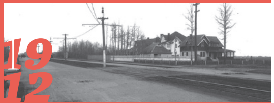
Streetcar rails on Jasper Avenue looking east at 121 St. n.d. (GAN D-3-2314)

Residential construction was unaffected by the French styles characteristic of Oliver's early public architecture. Even prominent francophone residents chose styles common throughout early Edmonton for their homes. The Four Square Style, modified Queen Anne Revival Style, and Bungalow Style were the most popular. Oliver offered a range of housing types: single family dwellings; row houses; duplexes; buildings with a mix of residential and retail; and apartment buildings. An equally diverse group of residents were attracted to Oliver. Millionaires perched their mansions prominently overlooking the valley on Victoria Avenue; middle class houses and workmen's cottages filled the streets behind them.