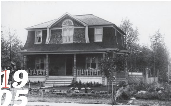
The Mountifield Residence, 1908