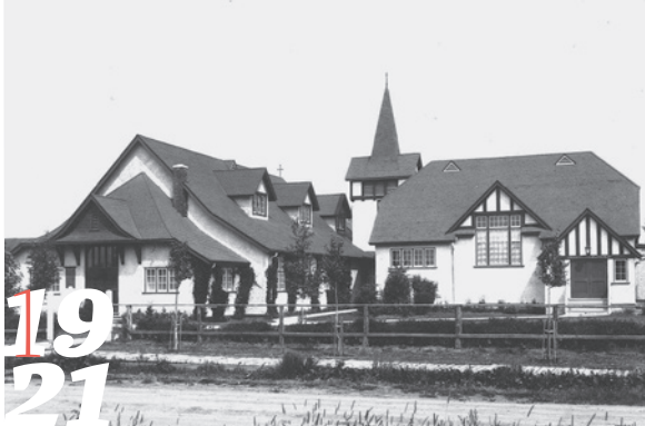
Christ Church and Christ Church Parish Hall c. 1926.