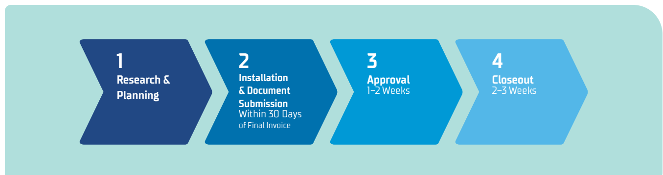
FIGURE 2: POST-INSTALLATION APPLICATION PROCESS

Refer to the Program Checklist to help guide you through your application process.