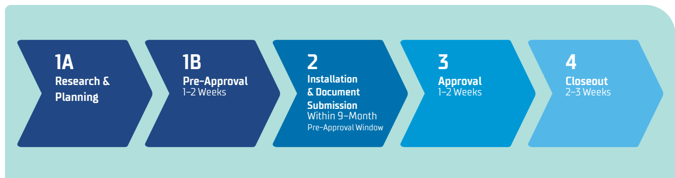
FIGURE 1: PRE-APPROVAL APPLICATION PROCESS

A rebate cheque will be sent to the participant and is expected to be mailed within two to three weeks of receipt of the digital approval letter. The participant will be sent an optional customer satisfaction survey.