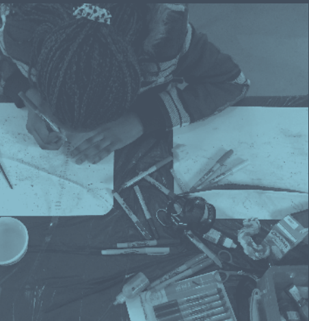
First FAVA Youth Film Fair.