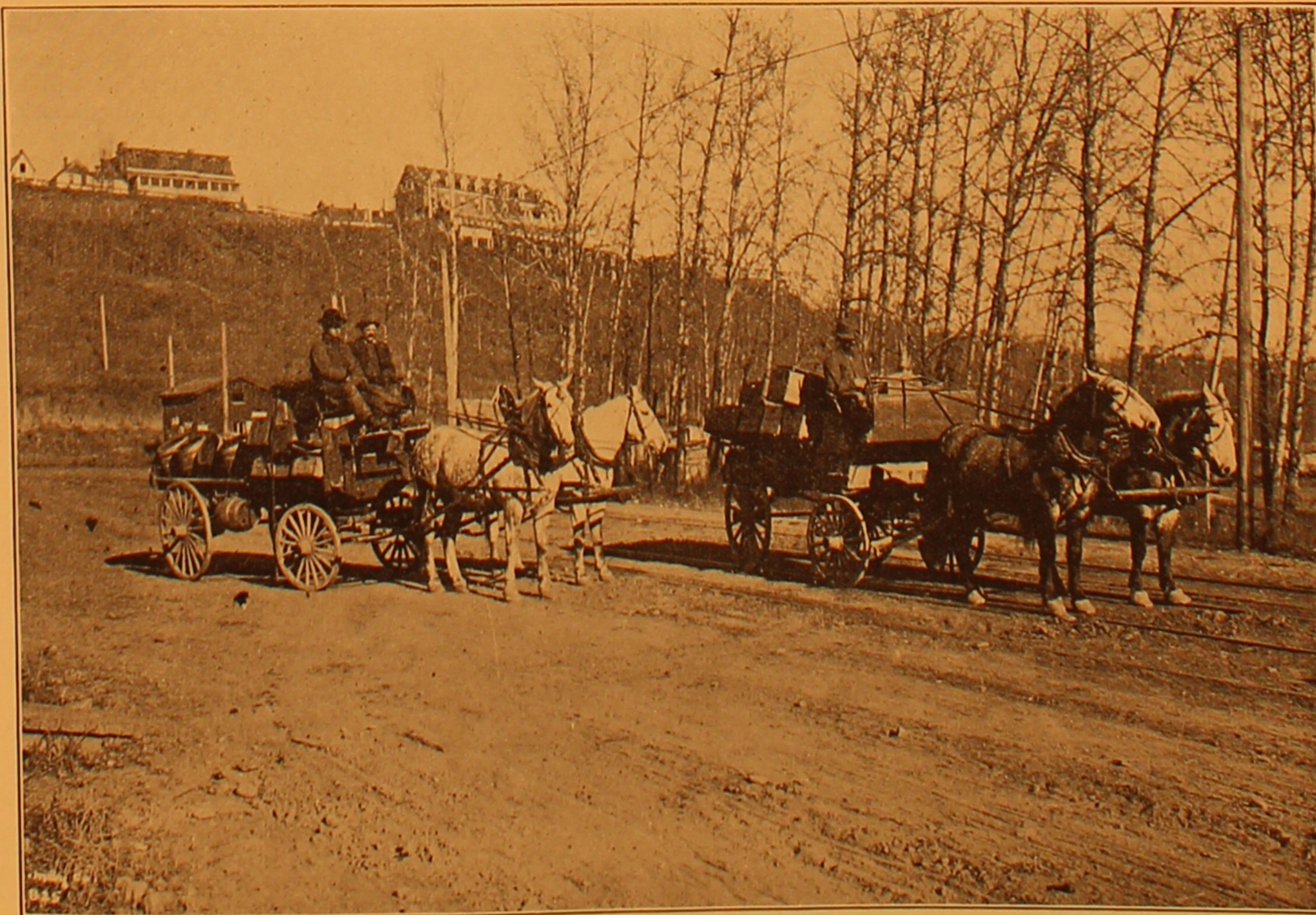
TWO TEAMS OF THE EDMONTON BREWING CO.

licity it may receive and to this end the Edmonton Brewing Company assists notably through the wide territory it covers, its products going through northern Saskatchewan, to the city of Saskatoon, as far south in Alberta as Calgary, and north and west.