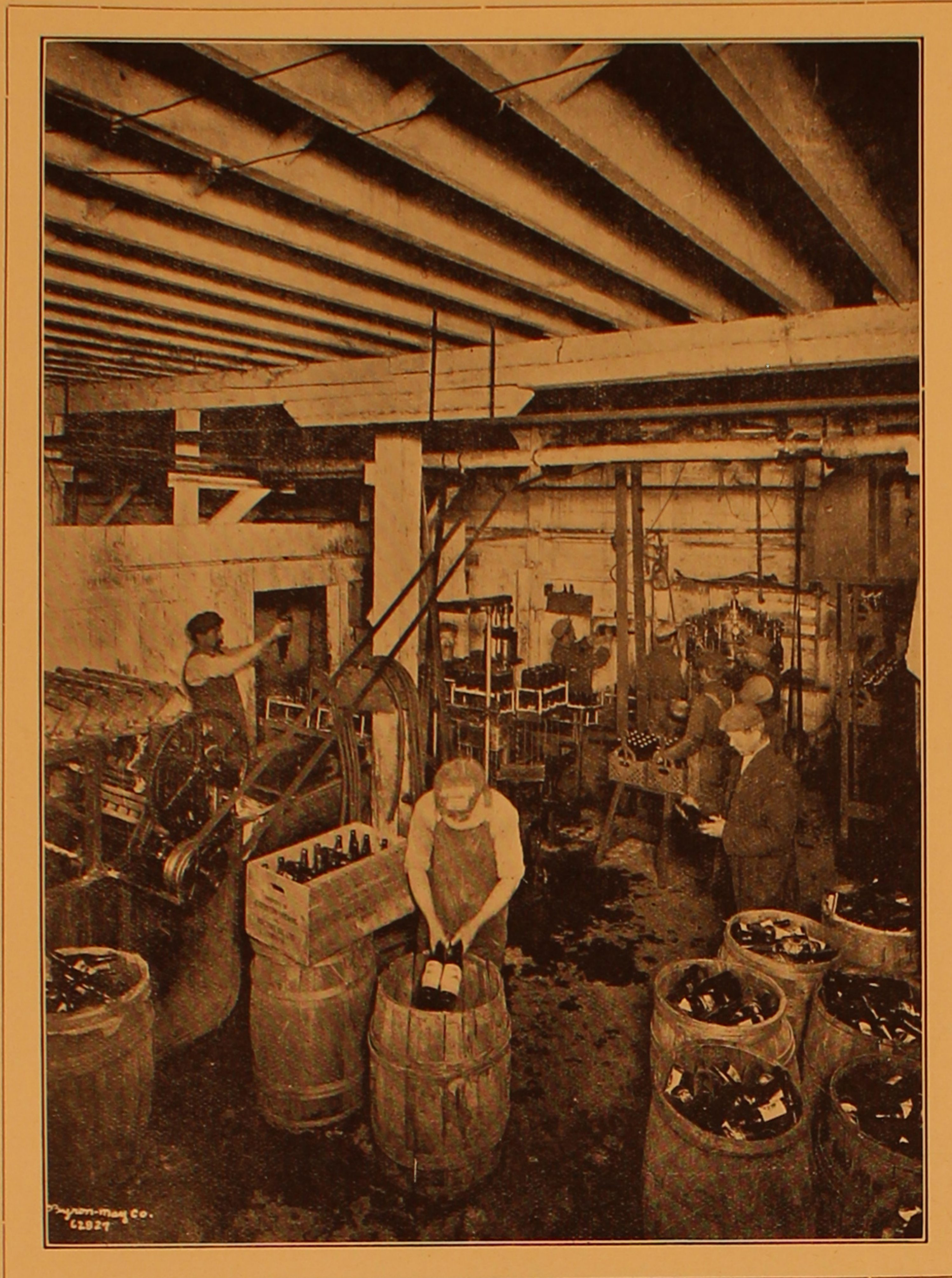
BOTTLING DEPARTMENT OF EDMONTON BREWING CO.

of public life for the past two years, is always ready and willing to lend his support and encouragement to any project that will benefit Alberta in general, or Edmonton and Strathcona in particular.