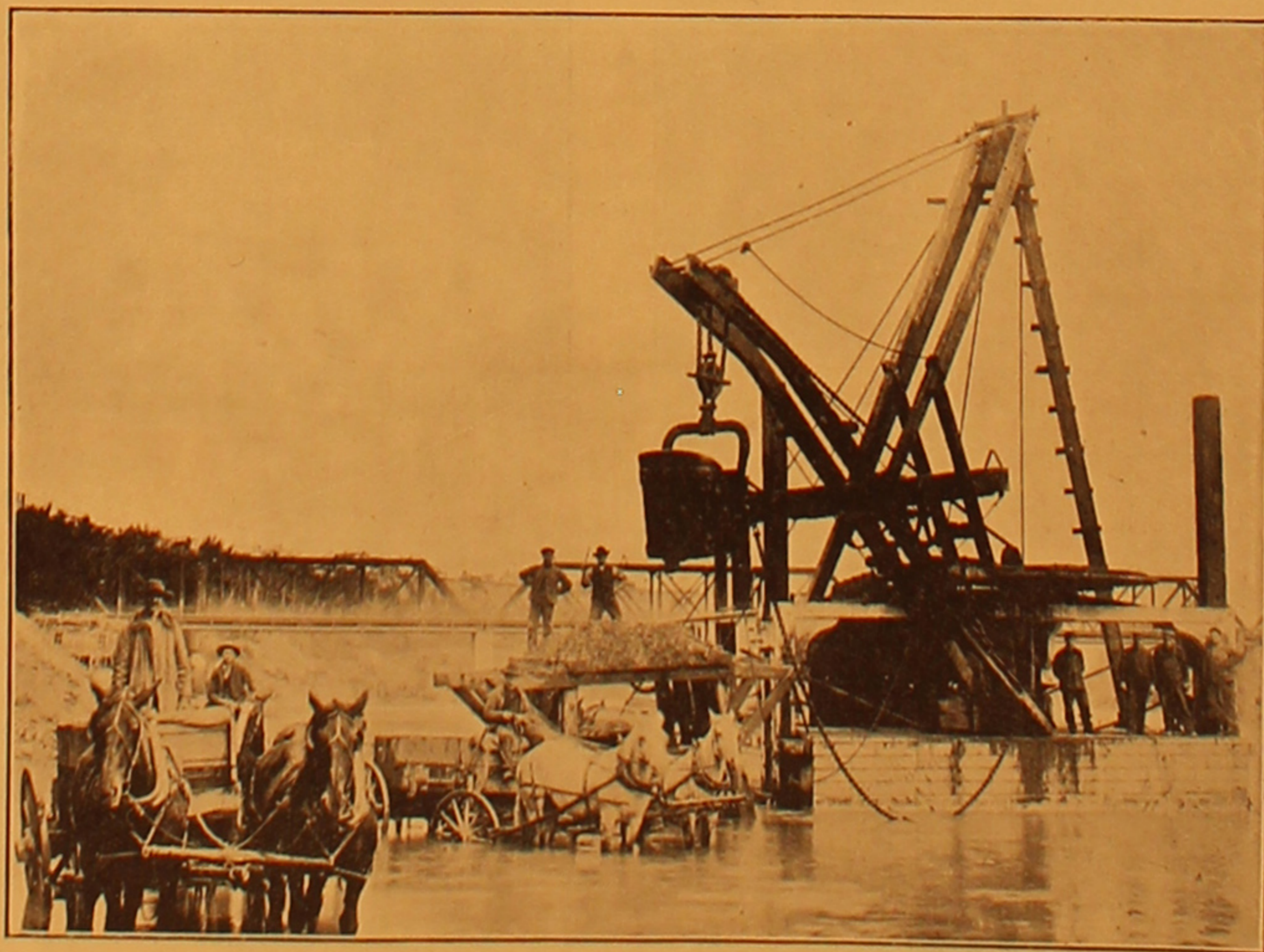
DREDGER ON THE RIVER

As was said at the beginning of this article, unless there was a field for a certain business, it could not be successfully carried on. Mr.