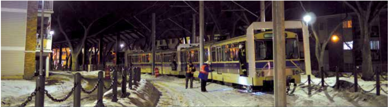
ONE OF THE FIRST TRAINS IS TOWED ALONG THE METRO LINE TO TEST WHETHER IT WILL CLEAR ALL STRUCTURES ALONG THE 3.3 KILOMETRES OF NEW TRACKS.

Construction on the Metro Line is complete, except for some minor close-out work. This work includes landscaping and some minor roadwork, both of which will resume when warmer weather allows this spring. Edmontonians can expect some minor lane closures while contractors complete the work.