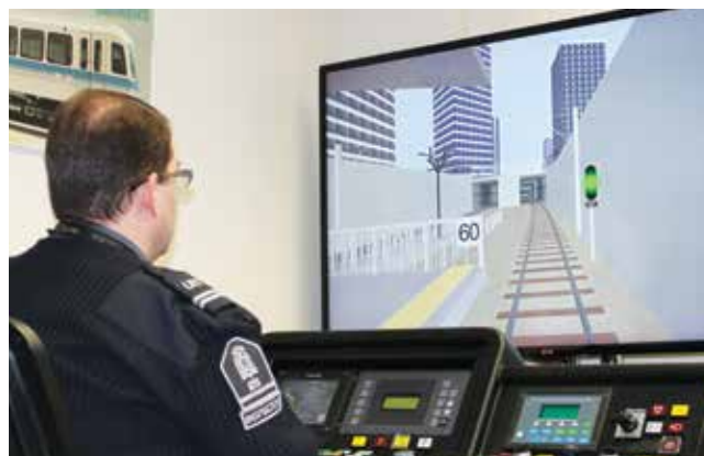
AN ETS INSPECTOR PRACTICES USING THE NEW CBTC ON A SIMULATOR.

The City is now aiming to open the Metro Line by the end of 2014 with reduced service. City staff are doing everything they can to help the contractor complete the signalling system on time. However, the City's priority is to make sure the CBTC can safely manage the flow of trains and traffic. The City won't open the Metro Line until it's safe.