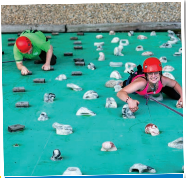
Spina Bifida and Hydrocephalus Association of Northern Alberta

Dates: Once a month by Zoom and once a month in person Location: Local coffee shop Ages: Adults 18+ with spina bifida and/or hydrocephalus Cost: Free with membership