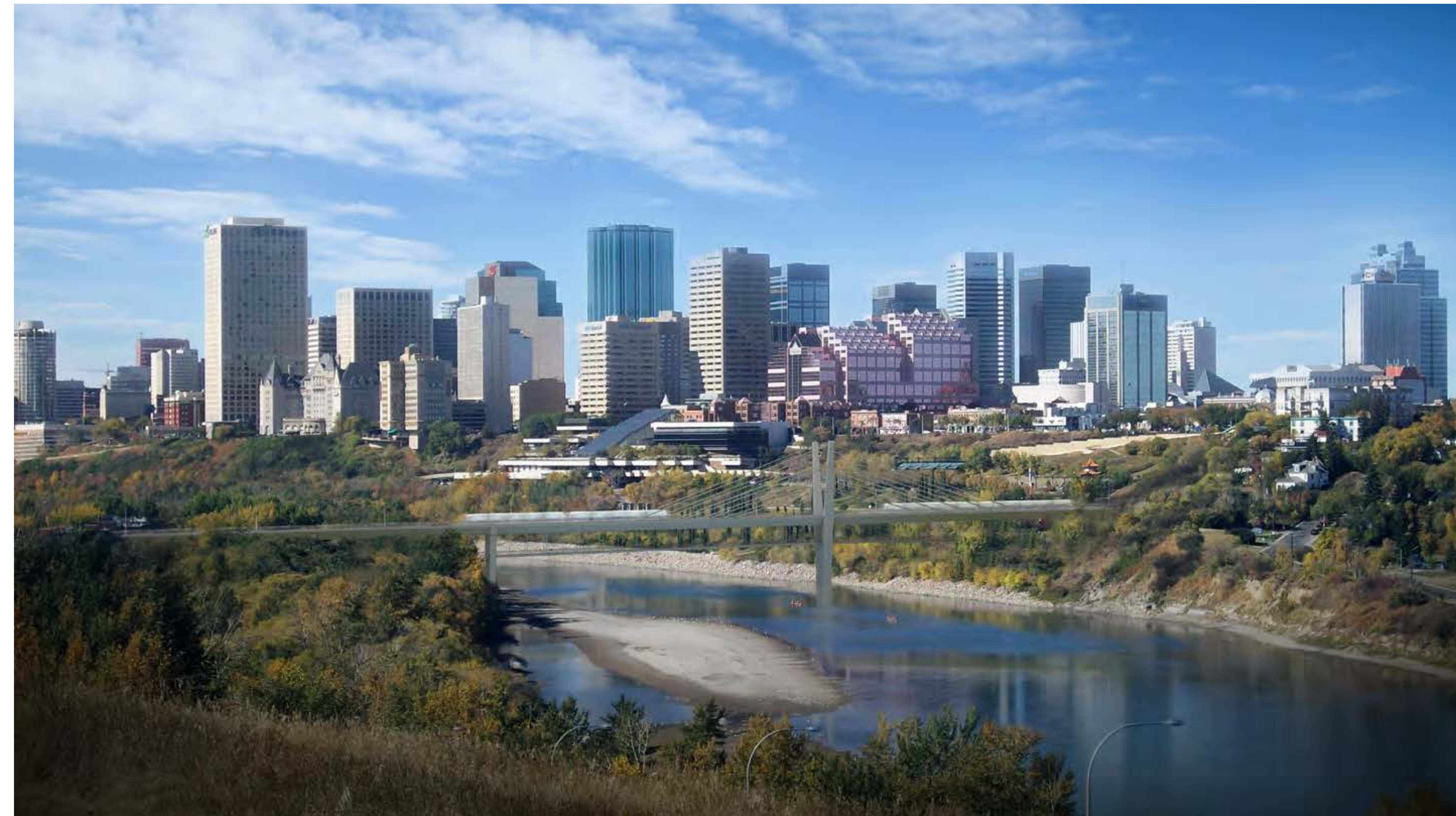
Extradosed bridge looking Northwest