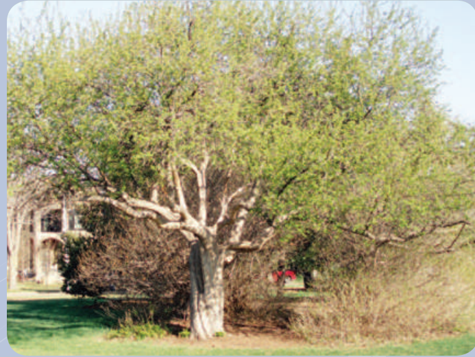
The Monkey Tree