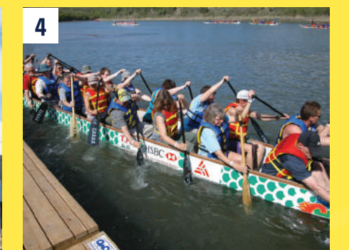
Dragon Boat Dock