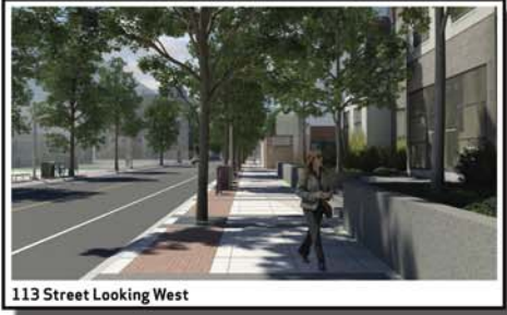
113 Street Looking West