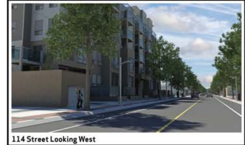
114 Street Looking West