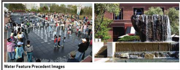
Water Feature Precedent Images