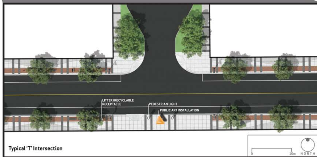
Typical 'T' Intersection