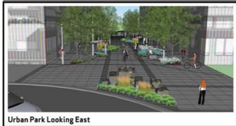
Urban Park Looking East