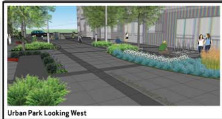
Urban Park Looking West