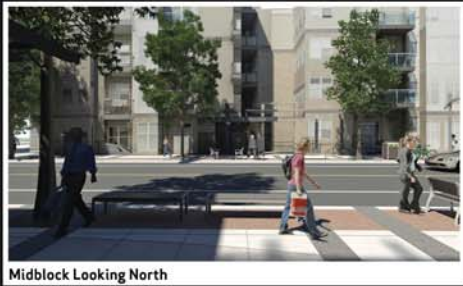
Midblock Looking North