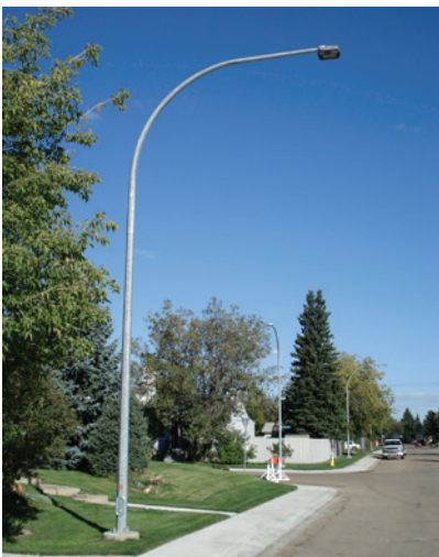
No Upgrade Standard Street Light

If you are a property owner in the neighbourhood and have not yet completed an Expression of Interest form, please submit the form by November 20, 2018.