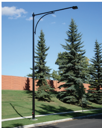
Upgrade Option Decorative Street Light