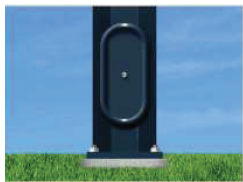
Pole Style: Octagonal