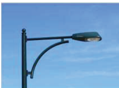
Decorative Arm: Heritage

The Decorative Street Light option in the Expression of Interest for the Royal Gardens neighbourhood includes the following: