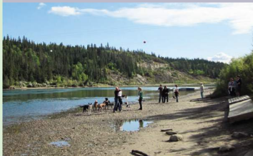
North Saskatchewan River, Buena Vista Park