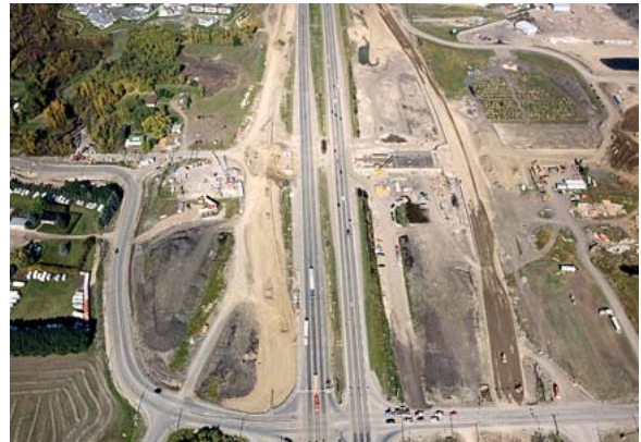
Ellerslie Road SW Upgrades, Edmonton

Urban dwellers are mainly unaware of the countless hours of meticulous design needed from the conceptual stage, progressing through preliminary design, and detailed design before construction can begin and concrete can be poured. Over the last four decades, Vic was involved and led countless major infrastructure projects, including Edmonton’s significant thoroughfares such as Rabbit Hill Road/Anthony Henday Drive Interchange, Ellerslie Road Upgrades from 50 Street to 170 Street, 17 Street from 23 Avenue to Whitemud Drive, to name a few. These routes are used by thousands of commuters each day, where safety and efficiency are the highest priority. Victor has overseen these projects with vision and the foresight to identify potential conflicts and rectify them before they are constructed on a massive scale.