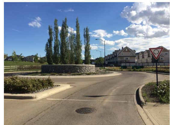
70 Street SW, Traffic Circle, Edmonton