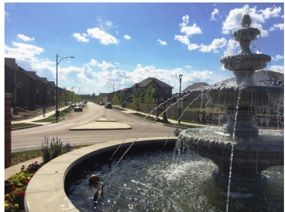
Keswick Way SW, Traffic Circle, Edmonton