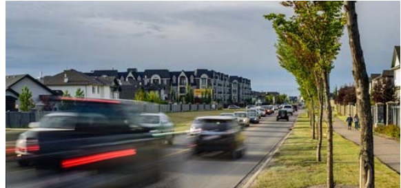
Rabbit Hill Road SW, Edmonton

At the neighbourhood level, Victor has been involved with community development in many neighbourhoods throughout the City of Edmonton. Victor has imprinted his signature style in neighbourhoods such as Summerside, Keswick, The Meadows, and the Hamptons, which now all bear the mark of his design elements and expertise. For instance, Traffic calming elements such as landscaped curb bump-outs along Summerside Grande Boulevard or traffic circles in both Summerside and Keswick neighbourhoods allow residents to safely navigate through their neighbourhoods in their car and on foot. Interesting neighbourhood entrance features provide landscaped boulevards and medians that are aesthetically pleasing and provide that sense of arrival to its residents and visitors. An exceptional number of these entrances in Edmonton's neighbourhoods have been carefully sculpted by Victor, being mindful of sightlines and vehicular transitioning from heavily trafficked thoroughfares to local residential roadways.