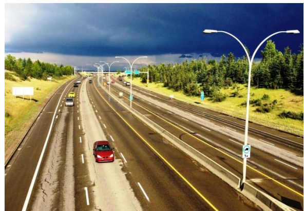
Whitemud Drive, Edmonton