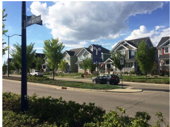
Summerside Grande Boulevard SW, Edmonton