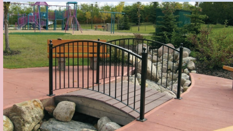
Falconer Heights Park