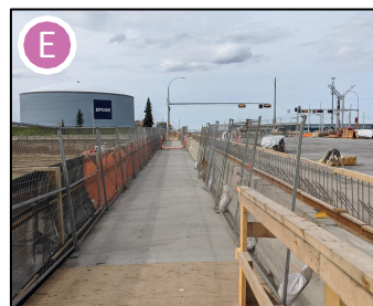
Pedestrian walkway over Whitemud Drive (TransEd)