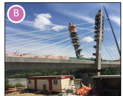
Tawatinâ Bridge Fifth Stay Cable Installation (TransEd)