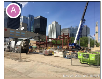
Churchill Connector Building Structural Steel Progress (TransEd)

TransEd Work in Q2: Construction of the Churchill Connector structure has begun (Figure A). Backfill around the storm tank is complete. Track installation continues on 102 Ave. On the Tawatinâ Bridge TransEd installed the fifth set of cable stays (Figure B) and extended the bridge deck with 27 of 41 segments complete. Muttart retaining walls have been cast and construction continues on the Muttart Stop. Construction continues on the wildlife underpass at Connors Road. Kâhasinîskâk Bridge structure has been placed (Figure C). Davies Elevated Guideway construction including rail installation is ongoing (Figure D). Earthwork and roadworks are ongoing at the Davies Station park and ride areas. Rail is installed continuously from Davies Station south to Mill Woods. The pedestrian walkway on the Whitemud Bridge has been temporarily opened for public use (Figure E). Landscaping work is ongoing (Figure F). Construction of the operations and maintenance building is nearing completion with electrical and mechanical installations ongoing. Overhead wires continue to be installed. Eleven LRVs have been delivered to Edmonton as of the end of June 2020.