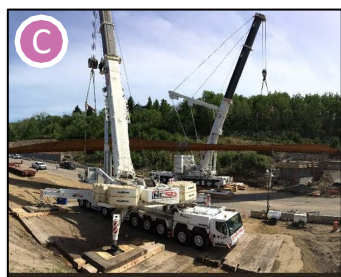
Kâhasinîskâk Bridge installation over Connors Road (TransEd)