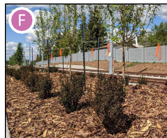
Landscaping along 66 Street (TransEd)