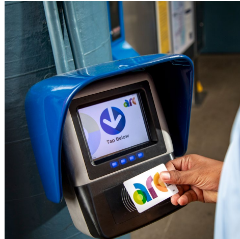
Arc fare validator at an LRT station