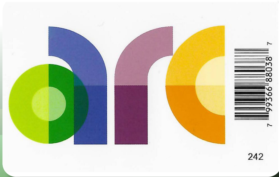
Front side of an Arc card

Arc cards are convenient and reusable. With Arc, you pay your transit fare by tapping your Arc card on a fare validator when entering and exiting buses and LRT proof of payment areas.