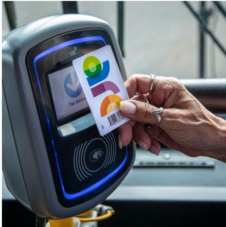
Arc fare validator on a bus

Arc fare validators (or card readers) are machines where you tap your Arc card to pay fare on buses and at LRT stations. The validators are located by the front and back doors of buses and at the entrance to the platform or on the platform in LRT stations. Remember to tap the card when going on a bus or into an LRT station. And, remember to tap off when you get off a bus or leave an LRT station.